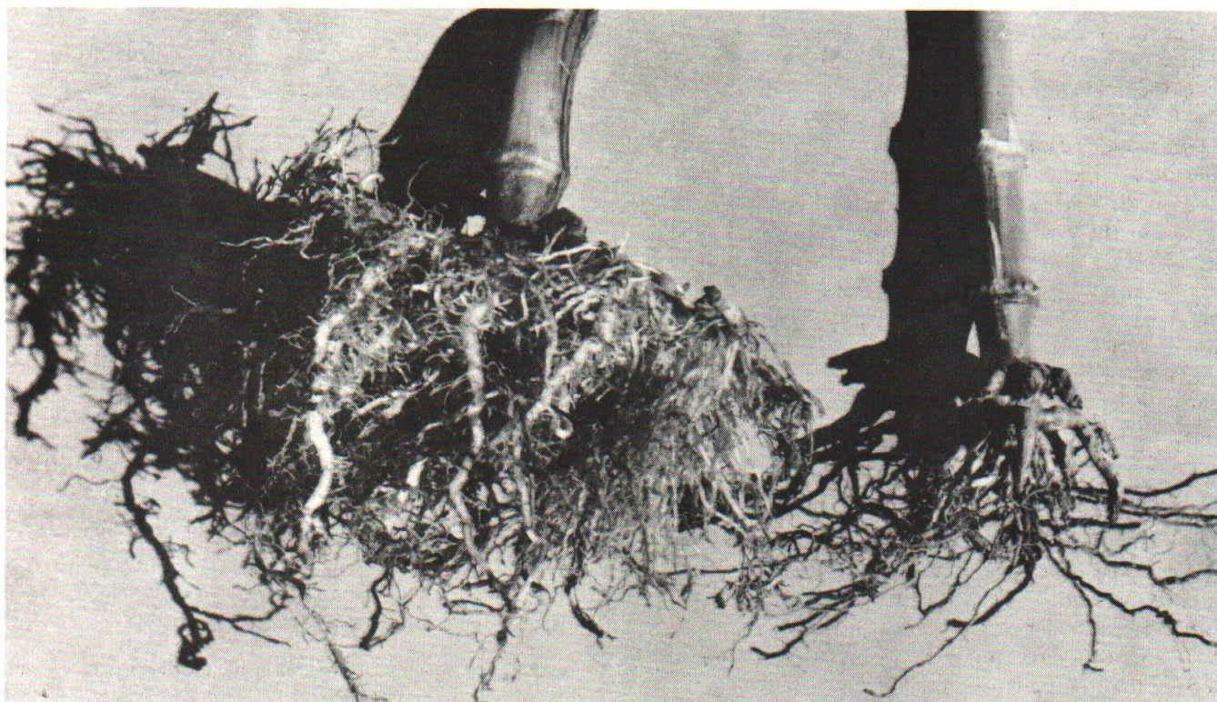
Figure 2. Roots on the right have been severely damaged by corn rootworm larvae; the roots on the left were protected from damage by an insecticide applied at planting time.

Rootworms are a pest where corn follows corn without rotation. The best way to control the rootworm is to rotate the corn with any other crop. Infested fields should be placed in rotation, unless there are real benefits from growing corn-after-corn in that particular field. The advantages of growing corn without rotation should be reviewed when problems develop with the corn rootworms.