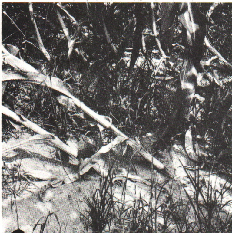
Figure 3. Lodging of corn caused by destruction of the roots by corn rootworm larvae. The stalks tilt right from soil level and often curve up (goose-neck) near their bases.

Insecticides should be used to control the rootworms in infested fields where rotation is not feasible. Remember that insecticides are poisonous; handle, store, and apply them with great care. The label on the insecticide container has full instructions for safe, effective use of that specific insecticide. Read the label before buying any insecticide.