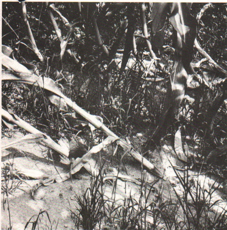
Figure 3. Lodging of corn caused by destruction of the roots by corn rootworm larvae. The stalks tilt right from soil level and often curve up (goose-neck) near their bases.

Planting band applications are made by spraying a liquid insecticide or applying a granular insecticide in a seven-inch band centered over the seed row. The band application may be made at planting or between the time of planting and seed germination. Apply the insecticide above, and out of contact with, the seed. Place the insecticide nozzle or spout between the seed spout and covering wheel of the planter. Make sure that the insecticide is covered with soil. A modified covering sheel or a light harrow in back of the insecticide applicator can be used. The planting band application is the least expensive and most convenient method of rootworm control on most farms.