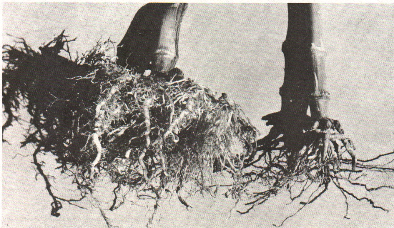
Figure 2. Roots on the right have been severely damaged by corn rootworm larvae; the roots on the left were protected from damage by an insecticide applied at planting time.

b) Leave similar swaths untreated and compare them with adjacent treated rows if you are now using an insecticide for rootworm control and suspect that you do not need it.