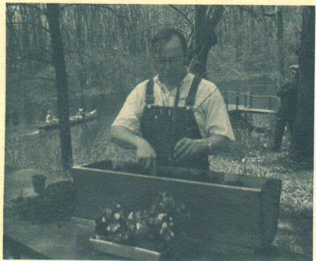
Figure 4—Composting is a way to recycle waste, organic material to enrich soil and beautify our environment.

After heating starts, turn pile every three or four days so that air enters the mass. Keep pile well watered.