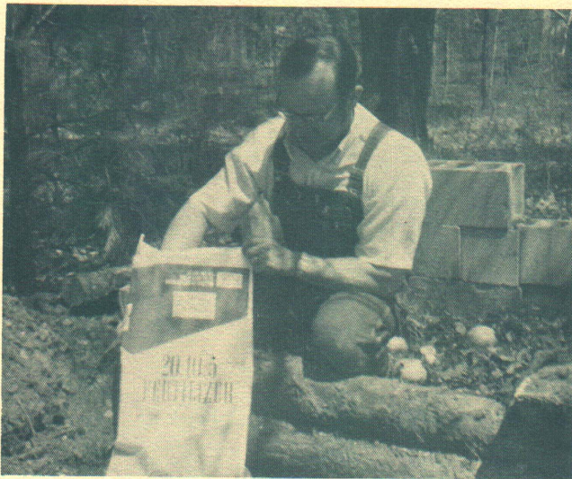
Figure 3—A fertilizer high in nitrogen will hasten decomposition. This one is 20-10-5.

use because of the variations in nitrogen content. However, do not use more than one-fourth pound fertilizer per 15 sq. feet of compost, 6 inches deep (about 6 bushels of heap).