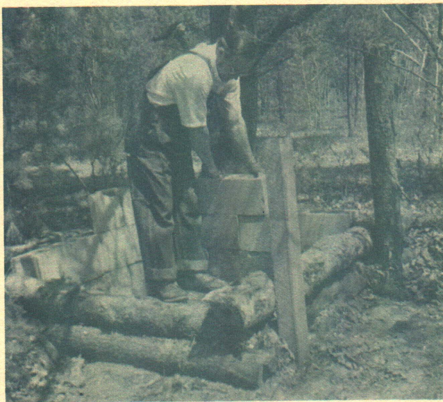
Figure 1—A fence is desirable to contain the compost pile. Dig a hole in the ground to increase holding capacity.

Some school teachers build small units for making compost for classroom demonstration. Others make sufficient compost for use on the school's shrubbery, trees and lawns. Community compost piles have been built for use by a neighborhood.