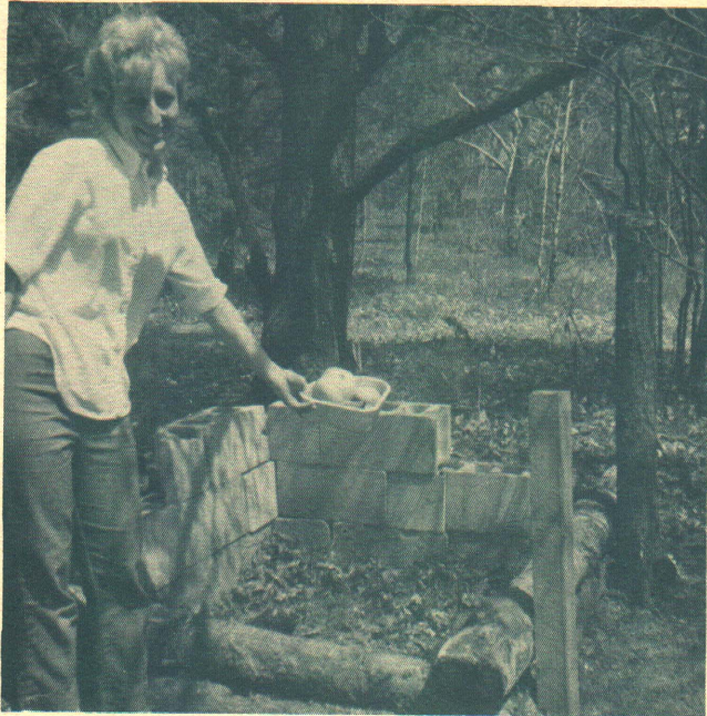
Figure 2—Compost is a good way to recycle garbage.

It is difficult to recommend an amount of fertilizer to