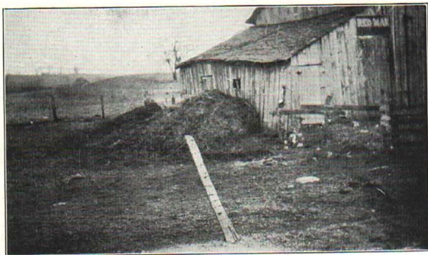
An expensive method of handling manure.

It is probably not necessary to discuss the loss occasioned by piling the manure under the eaves or by scattering it over the barnyard. In case it is not possible to construct a manure pit, the manure should be placed in a compact pile, with nearly straight sides, to keep it moist and well packed. Rail or board pens are often built in such a way that the live stock can keep the manure trampled. Horse and cow manure should be mixed in order to prevent "fire fanging" in the horse manure. The mixture can also be handled more easily.