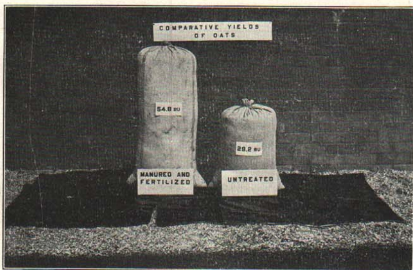
Yields showing value of manure properly balanced with phosphate.

In order to prevent this waste, a great many farmers of the state are reinforcing manure with 40 pounds of either 16 per cent or 20