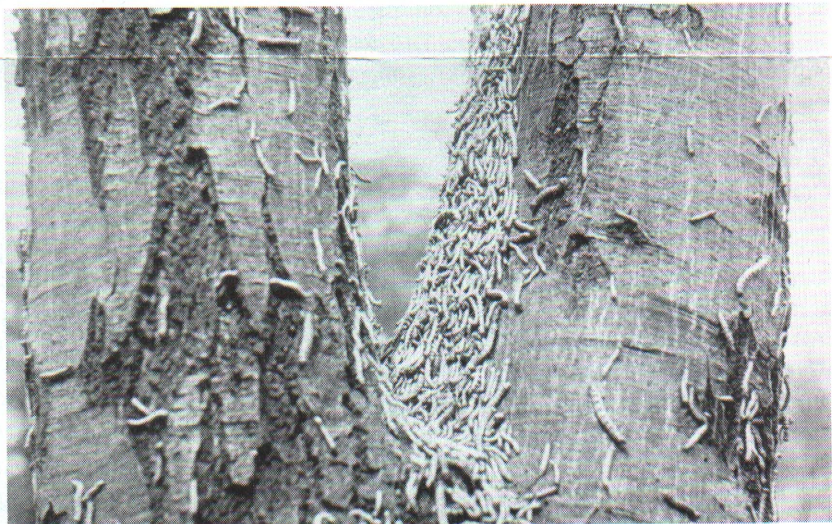
Fig. 2. Mass of redhumped oakworm larvae. In addition to stripping the foliage from trees and shrubs, larvae become a nuisance in towns and resorts as they wander about in search of food.