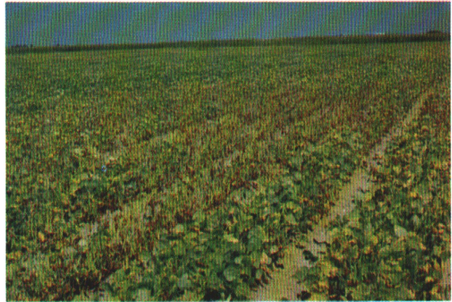
Blighted area in Navy bean field.