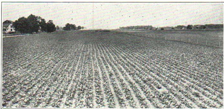
Fig. 1. A good stand is necessary for a high yield.

SELECT FIELDS having the best conditions for high production. Well drained, heavy, fertile soils which are relatively free from weeds should be chosen for this special crop.