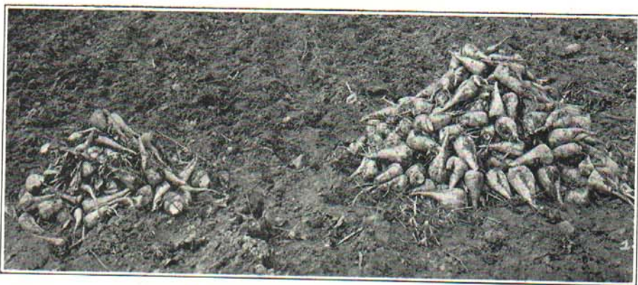
Fig. 3. No fertilizer vs. fertilizer.

BLOCK AND THIN the beets to the desired stand just as soon as conditions will permit. A beet every 12 inches at harvest time is considered a perfect stand by most growers. 8- to 12-inch spacing in the spring, depending on the width of rows, is generally necessary to provide a good stand in the fall. Uniformity of spacing between beets at harvest time is important in making full use of the land. Also, make certain that the laborers leave sturdy, thrifty plants, for the yield will be greatly influenced by the plants which are selected. Avoid "doubles" as much as possible.