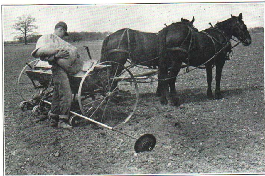
Fig. 2. Fertilizer with the seed stimulates early growth.

FALL PLOW FOR BEETS when possible and plow deep enough, on most soils, to bring a small amount of subsoil to the surface. Fall plowing is important in heavy production because it increases the available plant food, conserves moisture, improves the soil condition, and permits early planting. Spring plow as early as possible when fall-plowed land is not available. In many cases where the soil has been left in a mellow condition in the fall and the field is free from trash such as corn stalks and weeds, farmers are finding that disking in the spring gives as good or better results than spring plowing.