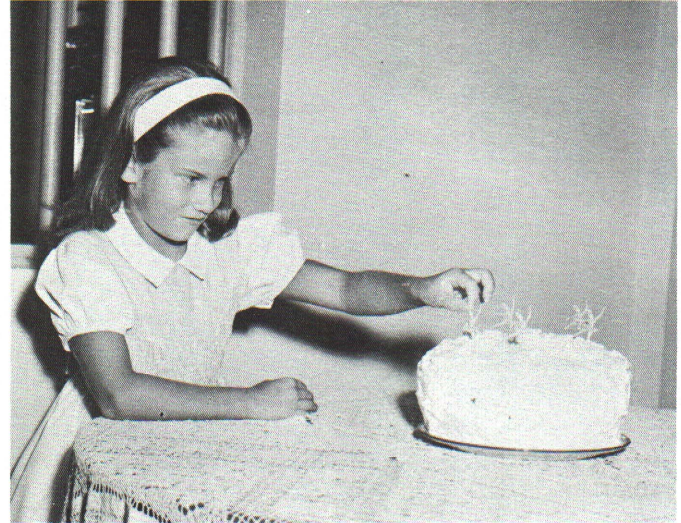
Sharing a birthday cake with family and friends is fun and habit forming.

In sharing as in spending, your child will need to make choices. Help him to decide when to share