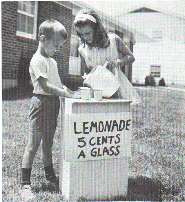
Opportunities for earning are not many at this age but deserve encouragement.