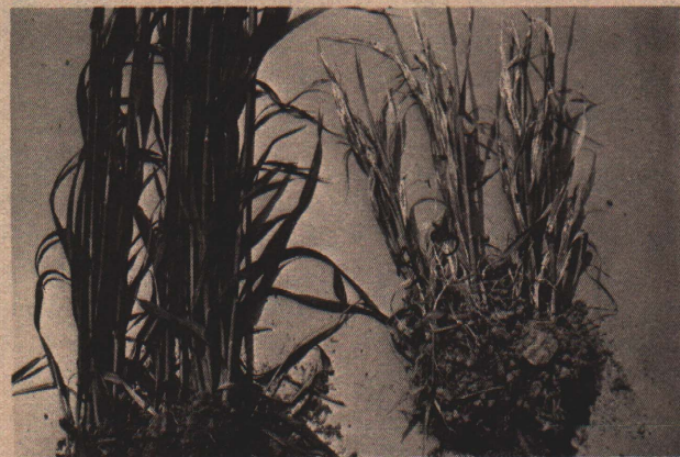
Cereal leaf beetle damage (right); healthy, unfested plants (left).