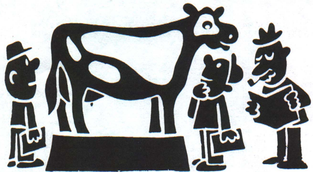
By Dept. of Animal Science Staff: Ted Ferris and Clyde Anderson

Sires are ranked in this bulletin by the expected differences of their future daughters and their herdmates as expressed by the Predicted Difference value for income (PD$$). The PD$$ combines economic aspects for both milk and fat. Due to the increasing average merit and number of sires available, we culled those Holstein bulls with PD$$ less than $125 and bulls of other breeds with PD$$ less than $75.