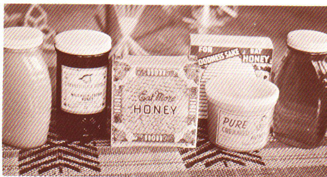
Honey prepared for sale in different forms.

It is very important that honey is not overheated at any stage of processing. Overheating drives off the natural, volatile flavors which make honey a unique product and chemically breaks down the levulose sugar. This darkens honey and gives it an off flavor.