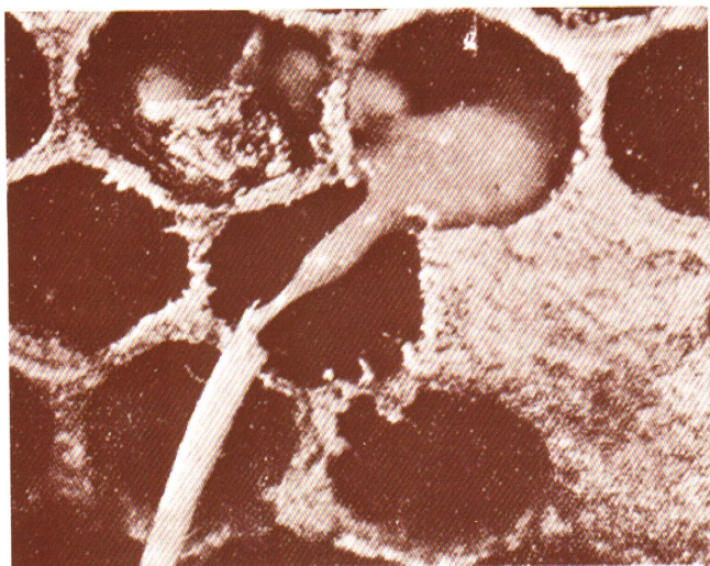
Brood dead from A.F.B. develops a glue-like consistency.

ease may be reduced by cleaning off dysentery-spotted frames and supplying clean water near the colonies. For serious cases, feeding Fumadil-B can be beneficial. Package bees from the South are often infected with Nosema. When the use of packages is an important part of the beekeeping enterprise, Fumadil-B should be fed in syrup, as packages are installed.