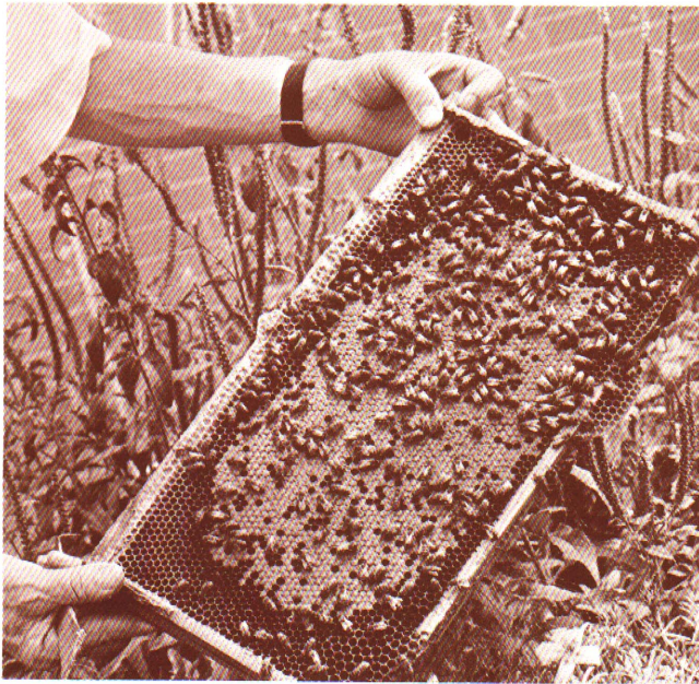
A solid patch of brood—indication of a good queen.

Well managed colonies usually produce a crop of honey. Poorly managed colonies often yield no surplus, and sometimes fail to survive. Some easy rules-of-thumb can help the beginner manage colonies. Increased knowledge of bee behavior and the yearly cycle of activities will enable the beekeeper to determine what needs to be done with a glance into a hive. Some management suggestions follow.