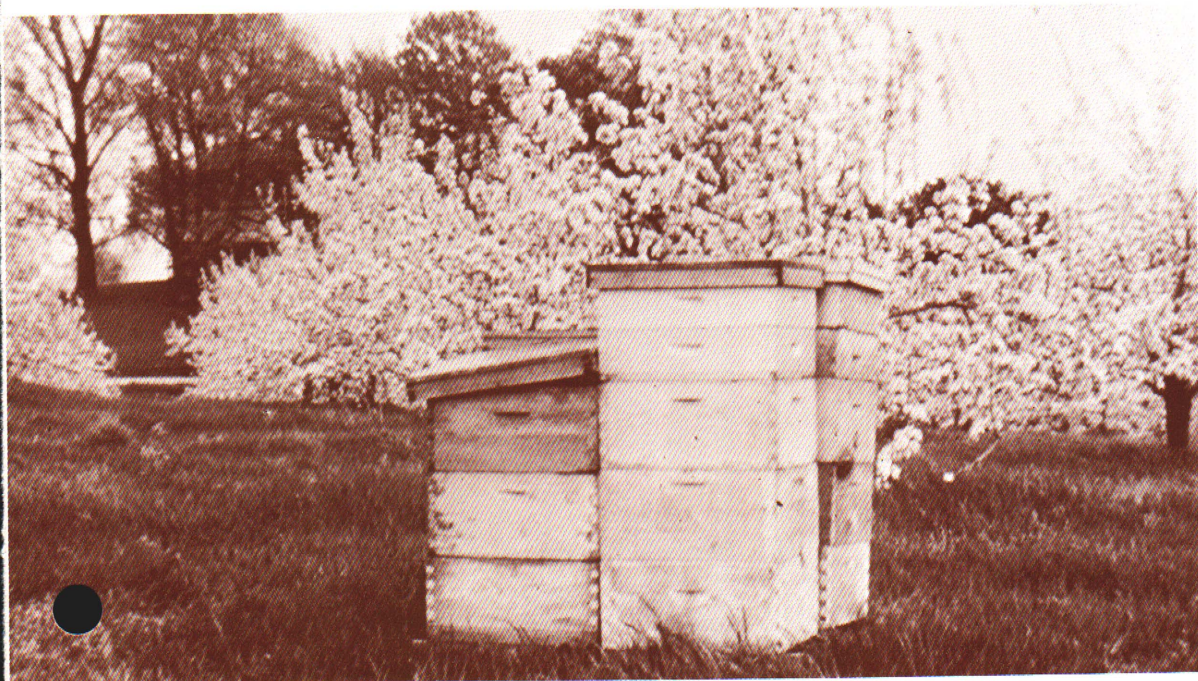
Bees in a fruit orchard.

A pollination specialist, particularly in fruit, must be acquainted with the grower's spray schedule. There should be an understanding between the beekeeper and the grower that insecticides will not be used during the bloom period to minimize spray damage to the bees. A brief, written contract can avoid misunderstandings. Check with your state association for suggested minimum charges.