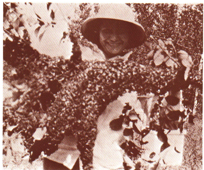
Capturing a swarm.

Swarming is the honey bee's natural method of reproducing the colony by splitting into two parts, one of which leaves the hive. Before swarming, colonies rear new queens in easily-observed, peanut-shaped cells. The old queen leaves with about half the bees and a young queen replaces her in the original hive. The first swarm which leaves the hive (prime swarm) clusters nearby on the branch of a tree or some suitable object and should be retrieved and installed in an empty hive. If the swarm is not retrieved, it will be directed by scout bees to a new location such as a hollow tree or inside the wall of a house. Swarming activity is most common from late May to early July.