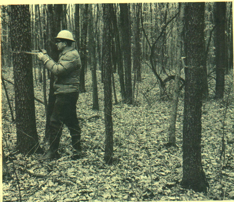
Figure 2 — Timber stand improvement practices should be initiated as soon as crop trees can be recognized. Crop trees in this stand are selected before beginning thinning operations.

Each acre of woodland is capable of growing a given amount of wood each year. This growth may accumulate on quality trees, defective trees or trees of an inferior species. The earlier cultural operations