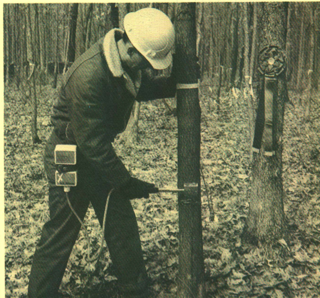
Figure 7 — Liquid herbicides can be applied by equipment which creates a frill and applies the herbicide in one simultaneous operation. The active ingredient being used at left is 2,4,5-T while cacodylic acid is being applied at right.