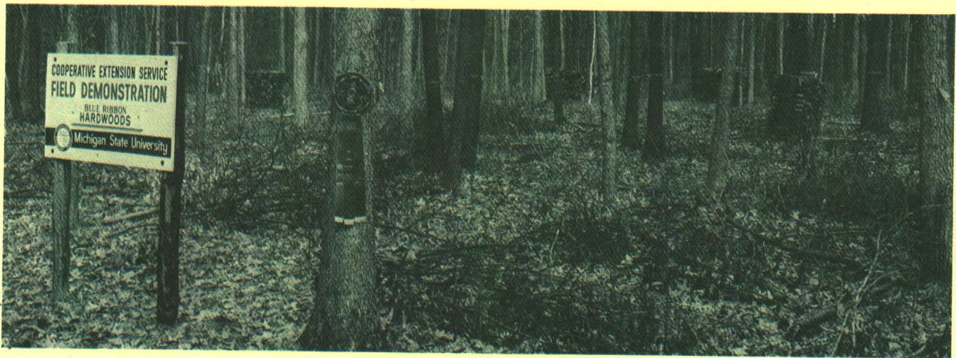
Figure 3 — Hardwood stand in which crop trees have been selected and released from competing trees which were cut for fuelwood. The value of the fuelwood was sufficient to pay for the cost of thinning.