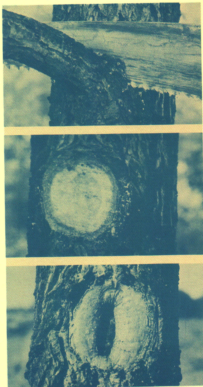
Figure 9 — Careful pruning will encourage rapid healing and increase bole quality. Pruning cut made flush with main bole (top), results in minimum wounding to the bole (center), which may be nearly healed after two years on thrifty tree (bottom).

All pruning should be done with a pruning saw which leaves an oval-shaped cut, flush with the stem of the tree (Fig. 9). Live-limb scars, less than one inch in diameter will normally heal completely within two to three years. When pruning dead limbs, the cut should be made closely enough to slightly injure the live tissue surrounding the limb. This will stimulate callous formation and bring about more rapid healing.