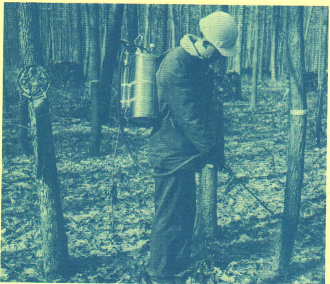
Figure 6 — Basal sprays of herbicides may also be used to kill undesirable trees. To be effective, the entire circumference of the lower 12 to 18 inches of the trunk must be saturated to the point of run-off.