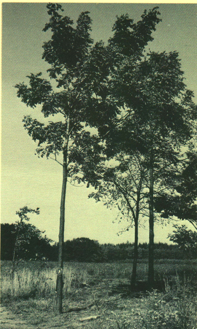
Figure 8—Young black walnut pruned to a height of approximately 17 feet. Research has shown that pruning the bole up to 50 percent of its total height will greatly increase quality without affecting rate of growth.

The maximum number of crop trees to select per acre varies for each species, depending on size, soil conditions and the market for wood products obtained in thinning and improvement cutting operations. Fewer crop trees should be selected in a stand with an average diameter of 12 inches than in a stand with an average diameter of six inches. Likewise, more trees can be left per acre when the forest stand is growing on well drained, productive soils than when growing on poorly drained, infertile soils. If a market is available for products removed in thinning and improvement cutting operations, extra crop trees may be retained when initial selections are made. In subsequent years, these can be removed in successive pre-harvest cuts to the number of crop trees which will be carried to maturity. In such cuts, the choicest, best-formed trees are usually left for a final crop tree harvest for veneer or high grade sawlogs.