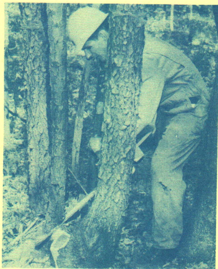
Figure 5 — Thinning a clump of black cherry trees. Smooth, sloping cuts should be made to reduce the likelihood of decay.