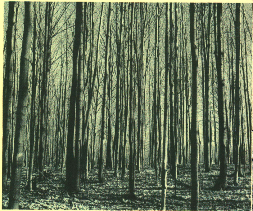
Figure 1 — Under proper management, this young second-growth stand of northern hardwoods can supply much valuable veneer and sawlog material.