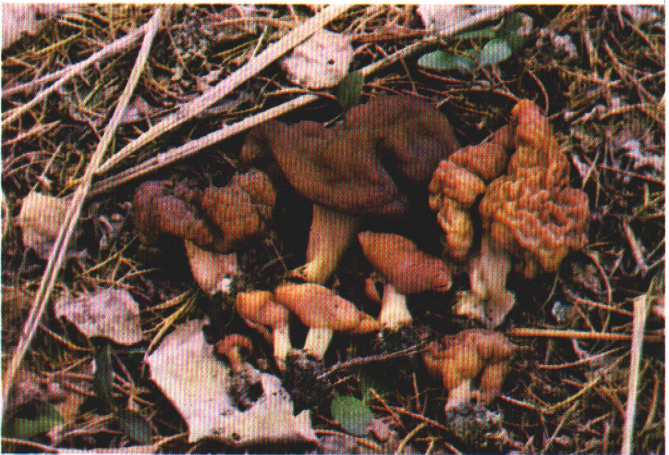
Helvella esculenta Questionable and unsafe for eating

Note the wide variation in color, size and surface texture.