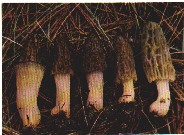
Morchella angusticeps Excellent for eating

NOTE: The two specimens at the left in the lower picture are too old to be suitable for eating.