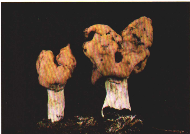
Helvella infula Poisonous