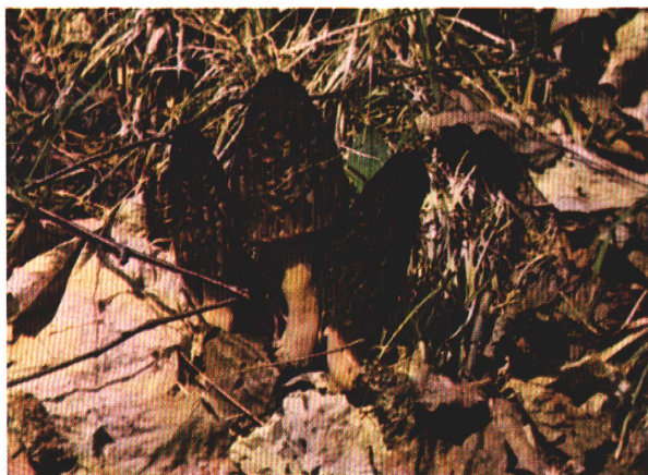
Morchella angusticeps (dark)