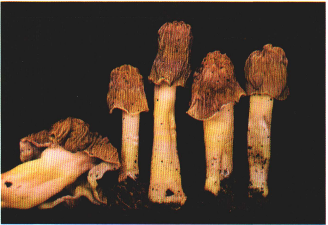
Verpa bohemica Questionable for eating