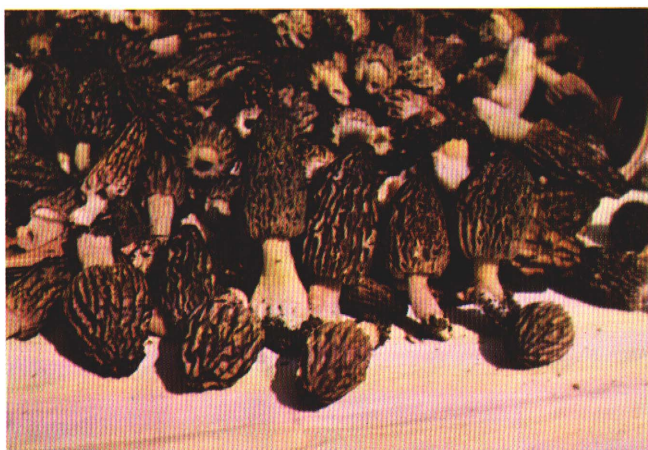
Morchella angusticeps Excellent for eating