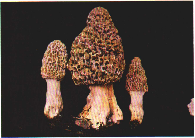
Morchella crassipes Choice for eating