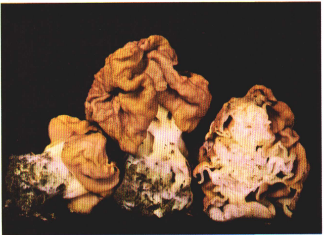
Helvella gigas Good for eating