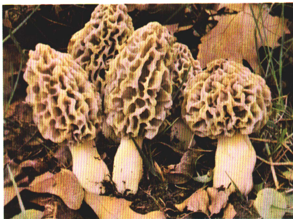
Morchella esculenta Excellent for eating