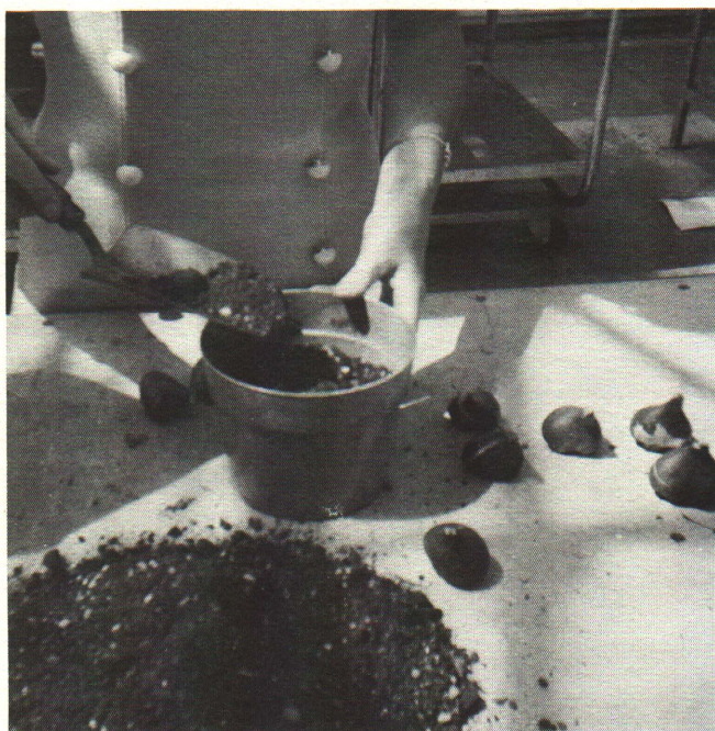
2. Filling Pots with Soil