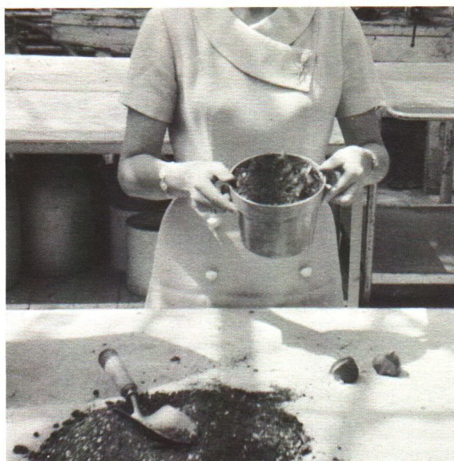
7. The Finished Pot