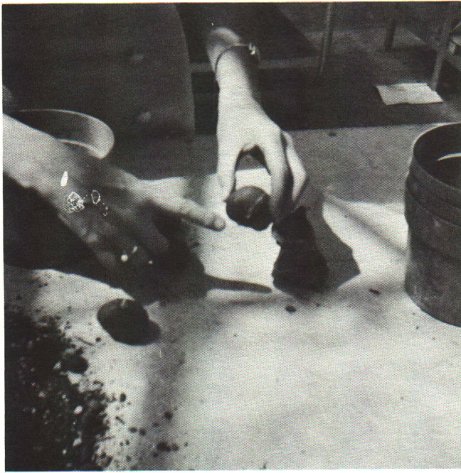
3. Observing Flat Side of Bulb