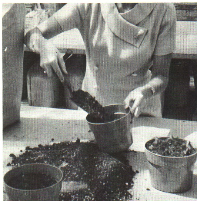
8. Various Stages of Potting

dropped or subjected to extreme temperatures. After purchasing, be sure that the bulbs are kept well-ventilated . If they are in paper bags, open the bag to allow maximum air movement. If possible, store them on open racks. Keep the bulbs in a room with a temperature between 55 degrees and 63 degrees F. Bulbs can be stored for several weeks at these temperatures.