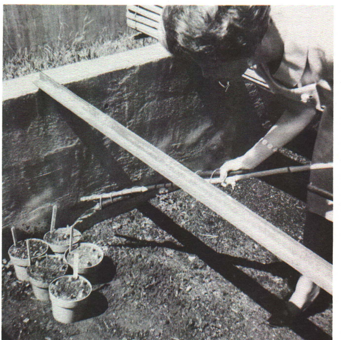
12. Watering the Pots

of the bulb will be facing the outside of the pot (See Figure 4). When this is done, the first big leaf of the plant will face outward and an attractive pot will be obtained at flowering.