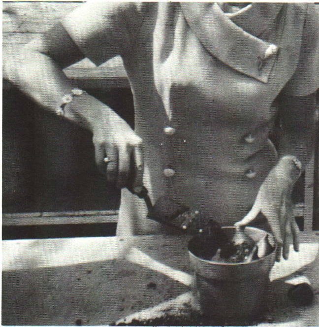
5. Covering Bulbs with Soil