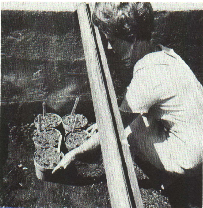
11. Setting Pots in a Cold-Frame