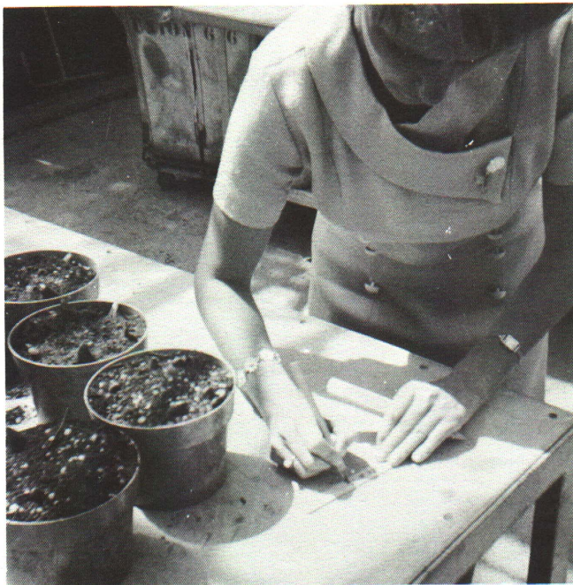
9. Marking Individual Pot Labels