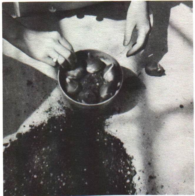
4. Correct Placement of Bulbs in Pot