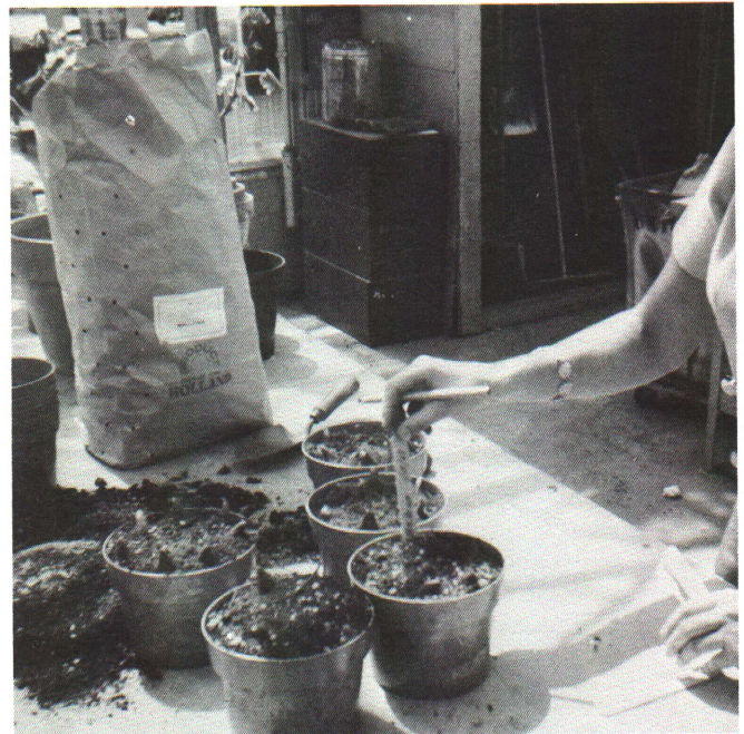
10. Placing Labels in the Pots

ing, plant late, and for early flowering, plant early. Remember the minimum length of the cold treatment should be 13 to 14 weeks.