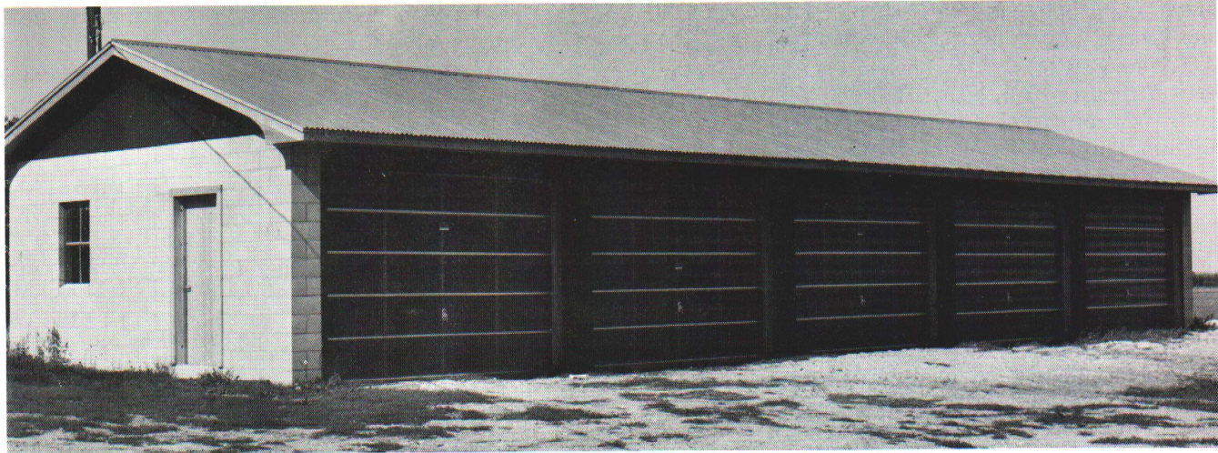
Good housing and good storage are provided in this dual purpose structure. Plan No. 719-C2-7.

If living units average six persons or more, a bathroom for each living unit in a motel costs no more than a central shower and toilet building. The central building requires cleaning labor, is at a disadvantage in cold weather, and can cause management problems. Individual bathrooms certainly help attract good workers and improve worker morale.