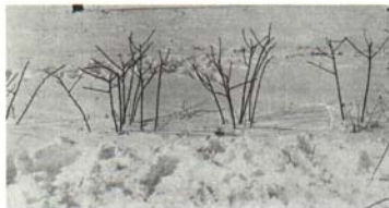
Left—black raspberry plants before pruning. Old fruiting canes were removed after harvest and do not appear here. Tipping in mid-season resulted in development of lateral branches. Right—the same plants after pruning. Laterals were headed back and small, weak canes removed.