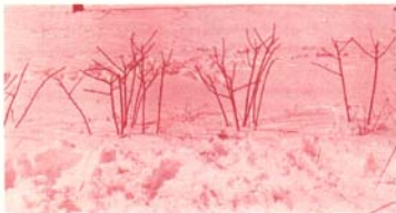
Left—black raspberry plants before pruning. Old fruiting canes were removed after harvest and do not appear here. Tipping in mid-summer resulted in development of lateral branches. Right—the same plants after pruning. Laterals were headed back and small, weak canes removed.