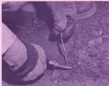
After planting black raspberries, remove old cane (handle) attached to the rooted, layered plant. This will reduce the danger of disease.

Keep plants protected from sunlight and wind during planting. When setting large plantings of raspberries, some growers use forest tree mechanical transplanters.