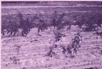
Virus-free red raspberry plants (background) are more vigorous, productive and produce more sucker plants than plants which are not virus-free. Compare to virus-infected plants (foreground).

Spacing of plants in the row and distance between rows depend upon the training system and type of tillage equipment used. Michigan growers use either the hedgerow, hill, or linear system. All three can be used with red and yellow varieties, while black and purple varieties should usually be trained to the linear system.