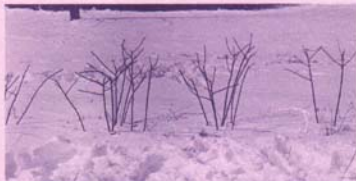
Left—black raspberry plants before pruning. Old fruiting canes were removed after harvest and do not appear here. Tipping in mid summer resulted in development of lateral branches. Right—the same plants after pruning. Laterals were headed back and small, weak canes removed. These raspberries have been trained to the linear system.

on all types of raspberries, except on the fall crop of everbearing types. Remove all suckers growing outside of the hills or rows.