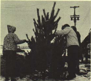
And here's another. If this is typical of the lot, this shopper may well end up buying an artificial tree.