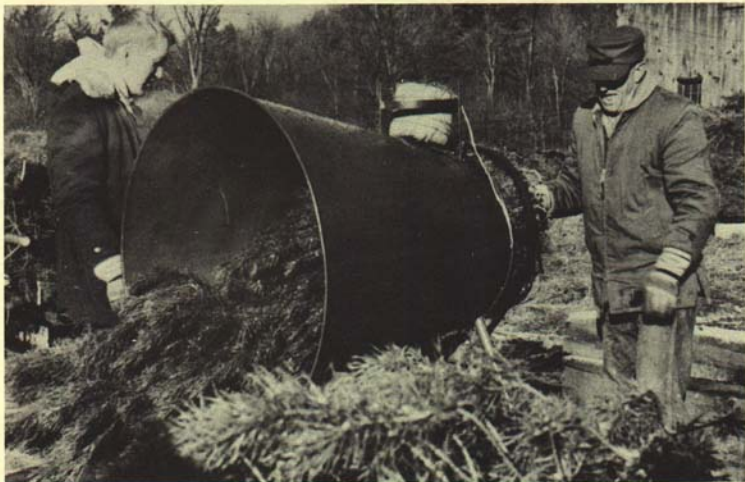
Mechanized tying saves time and also facilitates transporting of trees to market.

markets. For example, a Michigan grower ships to Illinois; the average wholesale delivered price there is $2.38 for a 5- to 7-foot Scotch Pine. Freight to Illinois will be around 25¢ per tree. This subtracted from the gross wholesale price leaves $2.13 gross for the producer. If the same tree were shipped to California, average freight would be 90¢; this subtracted from the wholesale price of $4.63 gives the grower a gross of $3.73 — a plus of $1.60 per tree gross return.