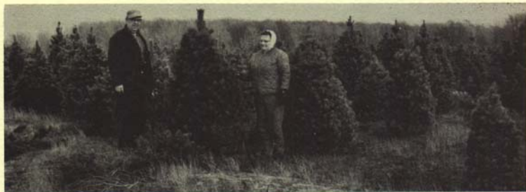
Above and right — Typical Michigan Scotch pine Christmas tree plantation.