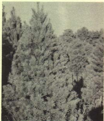
In a panel study, 75 Detroit consumers preferred the shape of the tree on the right, and 55 liked the one on the left. (See page 11.)