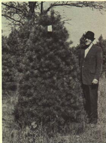
Here is a Federally graded "U.S. Premium" Scotch pine, tagged and ready to go to market.