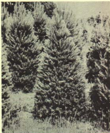
An unusually high quality planting of Scotch pine Christmas trees ready to be sheared. See pictures on page 7 and table and text on this page for Michigan consumer panel preference in Christmas trees.

Table 14 shows the consumer preference for a more compact tree. It is of greatest importance that producers shear for density and compactness of their trees. In the year a tree is to be sold, however, some branches should be allowed to grow so ornaments and decorations can be placed on the tree without too much difficulty (6).