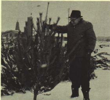
Here is a good negative example. This is the kind of tree that should never reach the retail lot.

This is a summary of all species of trees sold by retailers. If it were restricted to pines, the author suspects that crooked trunks and poor color would constitute a higher percentage of complaints on quality.