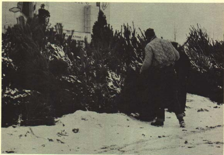
Another negative example. Even quality trees will not be shown off to advantage, and may be damaged if piled in a heap.