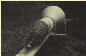
Not a space capsule on Mars — a new handy method of packaging Christmas trees in net plastic film.

Table 12 also shows that even now the average wholesale delivered price for a 5- to 7-foot Scotch Pine in the major producing states is less than $2.00 per tree. When costs of production, harvest, bundling, loading, transportation, sales, and risk are computed, most Christmas tree producers are losing money by selling trees in these areas (9).