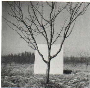
Fig. 4. A three-year-old tree trained to the modified central-leader system. The main scaffolds have wide angles where attached to the trunk. They are a little close together. In general, this is a strong framework.

Pruning the mature tree. The apricot produces most of its fruit on rather short-lived spurs. The principal problem with mature trees is to remove branches loaded with old spurs and keep the trees producing good replacement wood. To accomplish these objectives will require a combination of thinning out branches having many weak spurs, and heading back long branches to the first strong lateral branch. Mature