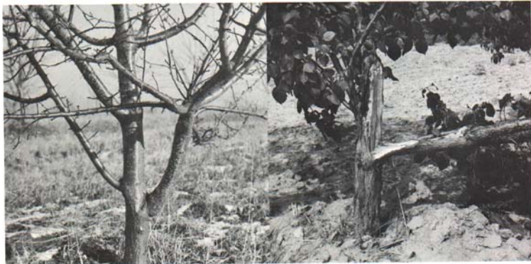
Fig. 2. Injury starting in a moderately sharp-angled crotch. This small canker should be repaired at once, or it could cause damage such as that shown in tree at right.

Training the young tree. Use the modified central-leader system and leave two main scaffolds on opposite sides of the trunk, well separated so they will not touch each other when fully grown. The first scaffold should be about 18 inches above the ground. The second scaffold should be 8 to 10 inches above the