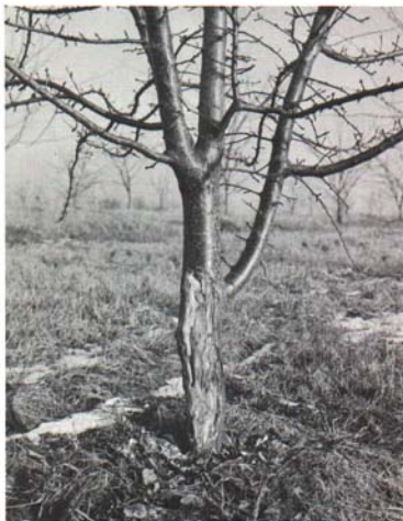
Fig. 7. Left: A large canker on the southwest side of the tree caused by winter injury. See comments in the text on this type of injury and suggestions to prevent it. Right: The same tree after the canker has been removed. The injured area is then disinfected with bichloride of mercury solution (see section on Removing Cankers) and the entire area painted with a non-caustic tree paint.