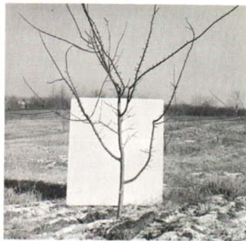
Fig. 3. A two-year-old tree that has been trained to the modified central-leader system. The main scaffolds are well spaced and have wide angles at the point of attachment with the trunk. Note: There is an extra branch that should have been removed in the top and possibly some heading back done, but the essential framework is good.

first. Select scaffolds having wide angles at the point of attachment with the trunk. Sharp-angled branches split badly (Fig. 2). The leader must be left longer than the scaffolds so that it will not be shaded out.