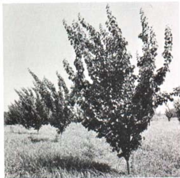
Fig. 6. A vigorous five-year-old apricot orchard. Notice especially the ground cover used to slow down the growth of the trees.

Potassium is the only nutrient element, other than nitrogen, that is likely to be needed in Michigan apricot plantings. Potassium deficiency reduces tree growth, yields, and fruit quality. The best way to determine need for potassium (potash) is through leaf analysis. When needed, potash may be applied in the fall or spring. Orchards low in potassium may need up to 100 pounds of potash ( K_2O ) per acre, but this amount can be applied in relatively large amounts every 3 to 5 years. The most common potassium fertilizer is muriate of potash (60 percent K_2O ).