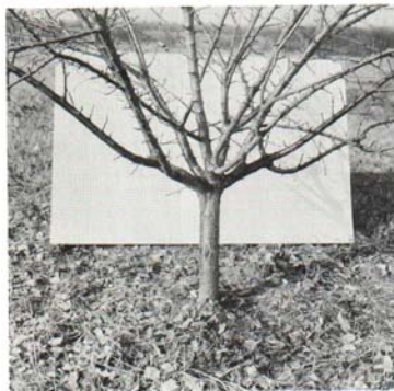
Fig. 5. A poorly trained tree with many branches originating at one point which will result in excessive crowding, splitting and winter injury. This type of tree will not live to maturity.

Chemical Weed Control. To avoid possible tree injury, herbicides should not be used in most non-bearing orchards, and only with considerable care in bearing orchards. Apricots are very sensitive to chemical injury. Growers using herbicide chemicals in apricot plantings should use only the lowest recommended rates of cleared materials. Complete control of weeds under the trees is not necessary and usually not desirable. It is usually best to apply no chemicals on light, sandy soil where there is sparse weed growth. See Extension Bulletin 433, "Chemical Weed Control for Horticultural Crops," for further information.