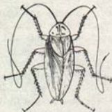
AMERICAN COCKROACH 1 1/2 inches long when mature

The oriental cockroach is black, 1 1/4 inches long when mature, and has short wings, the wings of the female being only rudimentary. It may take as long