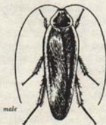
PENNSYLVANIA WOOD ROACH

For spraying in-doors, use oil solutions of either 2% chlordane; or 1/2% Diazinon; or 2% malathion; or 1/2% Baygon; or 2/10% pyrethrum and 2% piperonyl butoxide in combination with 2% chlordane.