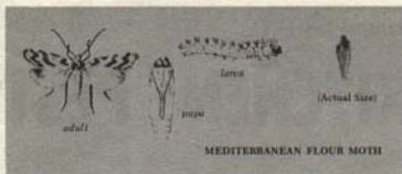
MEDITERRANEAN FLOUR MOTH