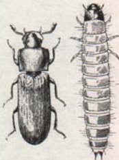
CONFUSED FLOUR BEETLE Adult (left); larva (right)