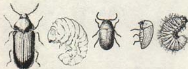
DRUG-STORE BEETLE Adult (left); larvae (right)

Beetles, mites, and moths may infest the kitchen and pantry foods in large numbers. These common household pests feed on a wide variety of foods, including: flour, pancake mix, corn meal, cereals, breakfast foods, red pepper, macaroni, dried fruits, nuts, dried meats, sugar, chocolate, tobacco, birdseed, drugs, etc. Several beetles, two moths and at least one mite fall into this category (see illustrations).