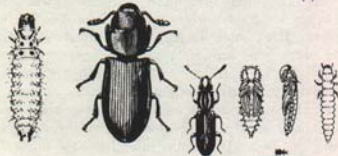
CADELLE BEETLE larva, left; adult, right