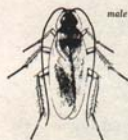
BROWN BANDED ROACH

The brown-banded roach is a handsome species in appearance, resembling the fearless denizen of the insect world, the tiger beetle. A habit of standing erect on its legs, probably in the search for food, also gives it the look of a hunter. It is about 1/2 inch long when mature, slightly smaller than its cousin, the German cockroach , and varies in color from dark brown to a light-golden. Two, yellow-crossed bands are found on the wings of the adult, one near where the wing joins the body, the other about 1/16 inch farther back toward the wing tips. The term "brown-banded", however, describes the immature form more accurately than the adult form since the bands are more conspicuous on the nymphs. The species likes temperatures over 80°F. and will develop to maturity in 150 days or less under this condition.