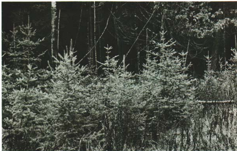
Fig. 3 Conifer reproduction in a clearcut patch 8 years after it was cut.