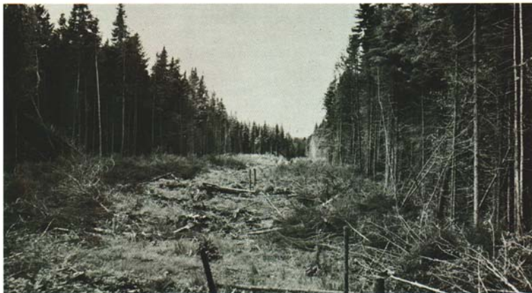
Fig. 2 Strip clearcutting in a conifer swamp. All trees in the strip were cut to favor conifer reproduction and to prevent poor trees from becoming a part of the new stand.