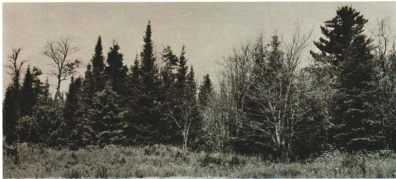
Fig. 1 Poor-quality red maple and birch overtopping conifers in this stand were killed by airplane spraying with a chemical.

Most conifer swamps have been logged at least once, and some two or three times. Many have also been disturbed by fire, wind, insects, disease, and animals. As a result of these disturbances stand conditions in most swamps are highly varied. Some are even-aged and others uneven-aged (page 3). Many are made up of irregularly-sized patches of seedlings, saplings and mature trees; others are uniformly stocked with trees of one size-class (page 4). Tree stocking is also variable, ranging from dense to sparse. Remnants of the original stand, usually composed of highly defective and cull cedar, are scattered throughout many stands. Competing hardwoods, often poor in quality, are present in most cutover stands.