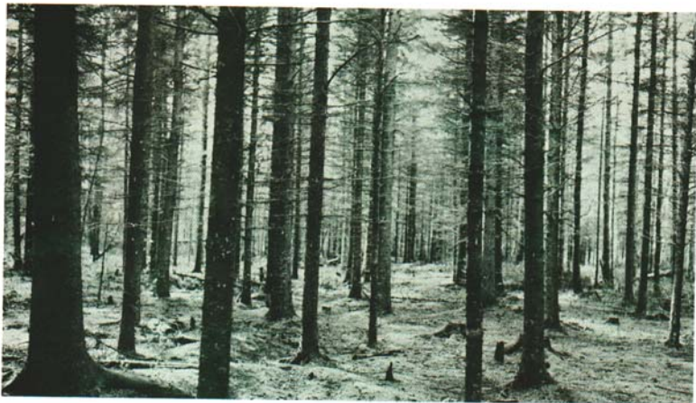
Fig. 9 This 55-year-old natural stand of upland spruce-balsam was first thinned when it was 30 years old and the second time when it was 45 years old. It is growing pulpwood at the rate of 1.0 cord per acre per year.

pends largely upon the market demand for products. On average sites unthinned cedar stands will yield 6-inch cedar posts in 60 to 80 years, and small poles at about twice this age. Faster growth can be expected in thinned stands.