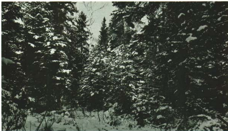
Fig. 10 The selection method was used to harvest mature pulpwood from this spruce-balsam fir stand. Trees were removed in small groups and singly.

When markets permit, remove merchantable aspen overtopping immature stands (Fig. 8). At the same time eliminate any seriously defective hardwoods and cull trees that may be present. This may be done by girdling, felling, or the use of chemicals. If the spruce and balsam fir is large enough to yield salable products, also do thinning where trees are too dense. In the thinning operation leave the best trees to grow and remove the poorest ones. Stands may be thinned two or three times as they develop to maintain a good rate of growth (Fig. 9). A suggested guide for thinning is to thin so that the average spacing between trees does not exceed \frac{1}{2} of the average height of the tallest trees. If the stand is made up mostly of balsam fir, a tolerant species, the spacing may be somewhat less.