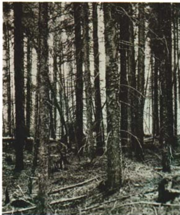
Fig. 4 A pure black spruce swamp.