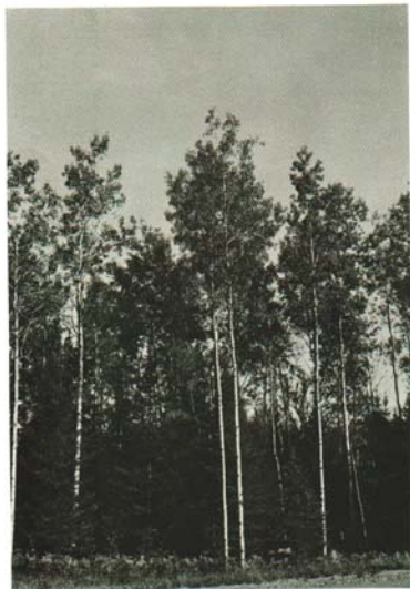
Fig. 8 Merchantable aspen overtopping a young, thrifty stand of spruce-balsam fir. Removal of aspen will improve growing conditions for the conifers.

with trees large enough to yield salable products may be thinned. Remove the poorer trees, especially those with a short weak crown (top), and leave the best ones to grow.