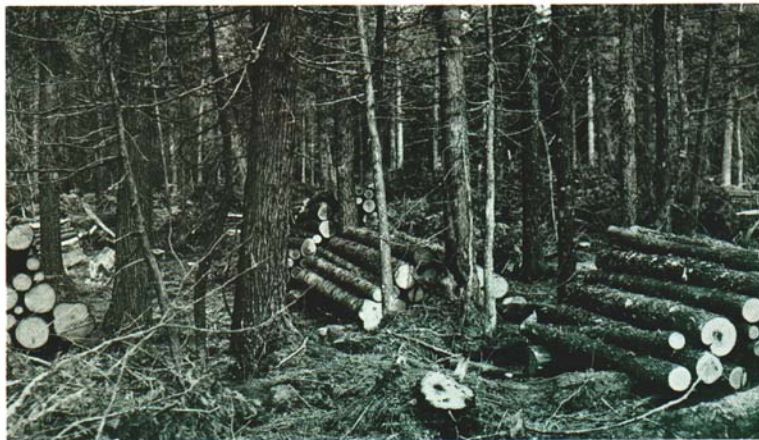
Fig. 6 A cedar swamp stand thinned for fence posts.

Present research shows that conifer swamps will reproduce themselves most satisfactorily when they are clearcut in strips (Fig. 2) or patches. Seedling reproduction of conifers usually becomes established (Fig. 3) within 5 to 10 years after clearcutting from seedlings present at the time of cutting, and from seed on the ground and blown in from adjacent stands.