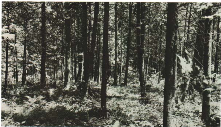
Fig. 7 A cedar swamp stand 12 years after it was thinned for fence posts. The stand in the background has not been thinned.

Compared to harvest methods that remove only a part of the stand, clearcutting in strips or patches results in the most conifer reproduction and less of the competing hardwoods. Hardwood brush growth (shrubs and young trees) that develops can be eliminated by cutting it out, or spraying it with chemicals, at an early age. This early treatment of the stand, 5 to 10 years after clearcutting and when the conifer reproduction is about 5 feet in height, will help much to reduce the amount of hardwoods in the next stand and improve growing conditions for young conifers.