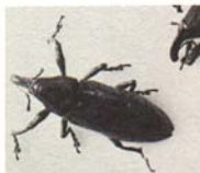
The corn billbug damages thousands of dollars worth of forage crops each year.