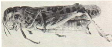
The grasshopper is a familiar pest of forage crops.