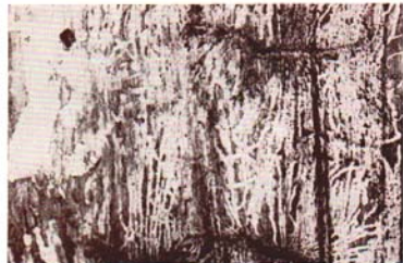
Fig. 6. Egg galleries of the native elm bark beetle (greatly enlarged) run ACROSS the grain—not lengthwise to the grain as those of the European variety.

Destruction of root grafts can be best accomplished with the soil sterilant, Vapam. This chemical has