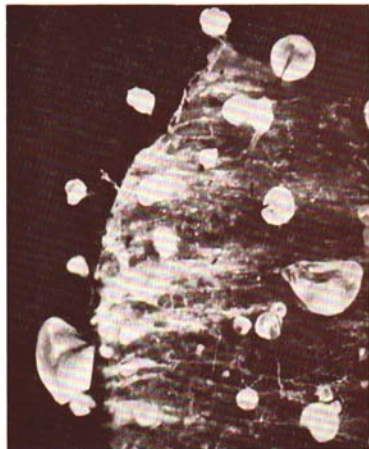
Fig. 5. Enlarged photograph of diseased elm wood on which fruiting bodies of the fungus have developed. White globular areas contain spores in a sticky matrix.

SANITATION means keeping all old and dying branches pruned out of elm trees. In addition, promptly remove elm trees that are diseased, dead, or in low vigor from insect attack, flooding, soil fills, lightning, ice injury, or other causes before the beetles breed in them. Beetle-infested elm material found between May 1 and August 1 should be disposed of immediately. Such material found after August 1 should be disposed of before May 1 of the following year. Sanitation is a basic procedure in