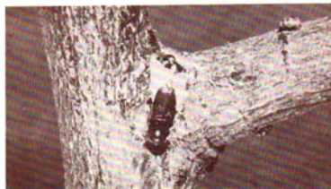
Fig. 2. Smaller European Elm Bark beetle feeding in a twig crotch. Spores of the fungus are carried from diseased to healthy trees by this feeding habit.

You go about getting this examination in the following way.