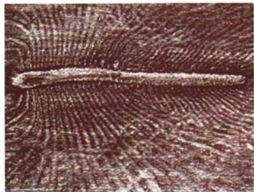
Fig. 4. Enlarged photograph of wood infested with the Smaller European elm bark beetle. Note that the egg galleries are constructed WITH the grain. This insect is the most important carrier of Dutch elm disease.

THE NATIVE ELM BARK BEETLE ( Hylurgopinus rufipes ) is small, only 1/16 to 1/12 inch long. Apparently it has one generation a year in Michigan. This beetle overwinters as an adult in the bark of