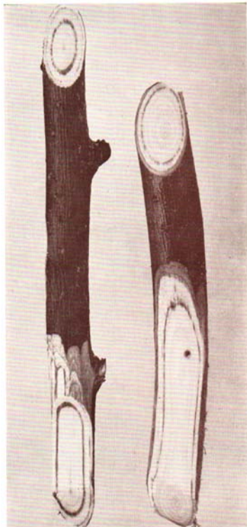
Fig. 1. Typical appearance of branch pieces from a Dutch-elm-diseased tree. The discoloration appears as a ring of BROWN DOTS in the diagonal cross sections, and as long BROWN STREAKS in the longitudinal sections. This BROWN DISCOLORATION is located in the wood just beneath the bark.

All elms are susceptible, with the American elm being the most susceptible. Chinese and Siberian elms are highly resistant to the disease, although individual trees have died from the disease in Michigan. Several hybrid elms, produced both in this country and in Holland, have been advertised