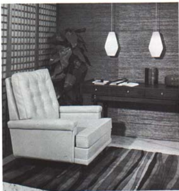
Figure 3—Vinyl plastic upholstery covering

Upholstery fabrics should be strong and closely woven. They should be comfortable to the touch. And the appearance of the texture should be pleasing.