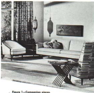
Figure 1—Companion pieces.

Today, you can select upholstered furniture from a wide range of styling. Within this wide range many pieces have part or all of the frame exposed while others are fully upholstered.