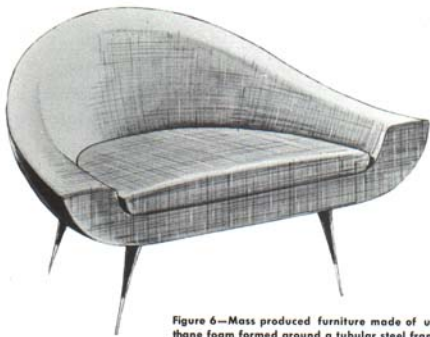
Figure 6—Mass produced furniture made of urethane foam formed around a tubular steel frame. The fabric is glued on.