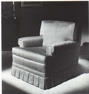
Figure 2—Good tailoring.

Outer Material. In better quality furniture the same quality of outer covering is used on all parts. That includes the areas under the cushions and across the outside back.