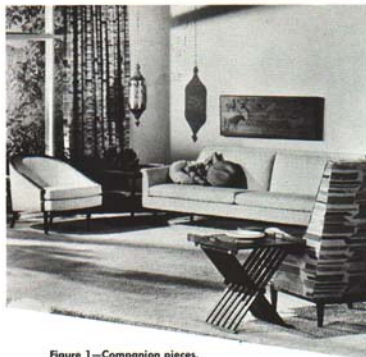
Figure 1—Companion pieces.

Today, you can select upholstered furniture from a wide range of styling. Within this wide range many pieces have part or all of the frame exposed while others are fully upholstered.