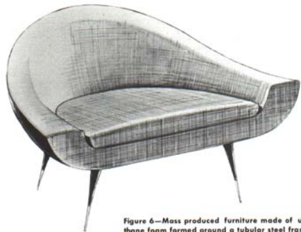
Figure 6—Mass produced furniture made of urethane foam formed around a tubular steel frame. The fabric is glued on.