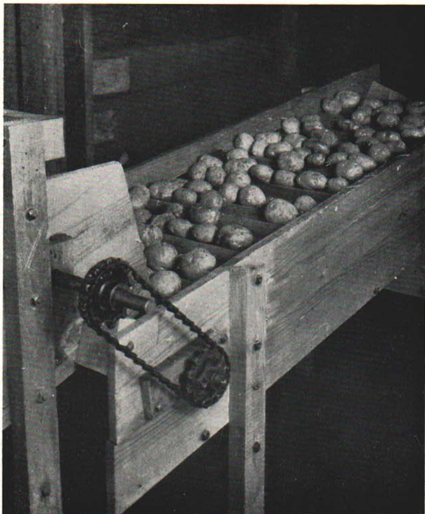
Fig. 7. Equip the grader with a roller-picking table to facilitate the removal of defective potatoes.