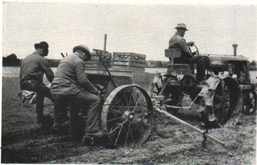
Fig. 2. Plant in deep mellow soil.