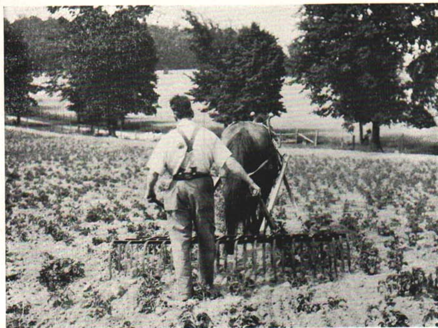
Fig. 3. Control weeds and grass early with a weeder.