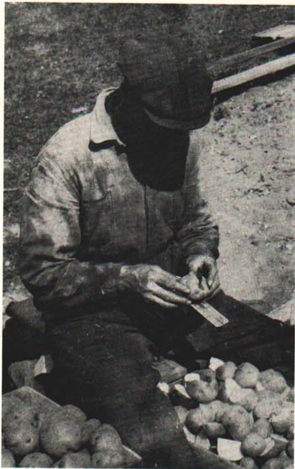
Fig. 1. Cut seed pieces large and blocky.