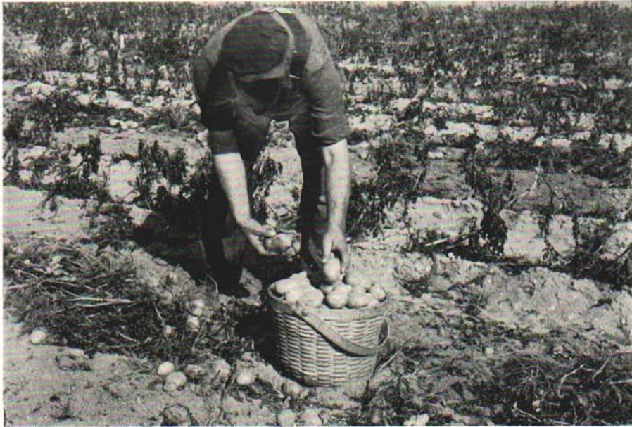
Fig. 6. Padded baskets are the most satisfactory picking containers.