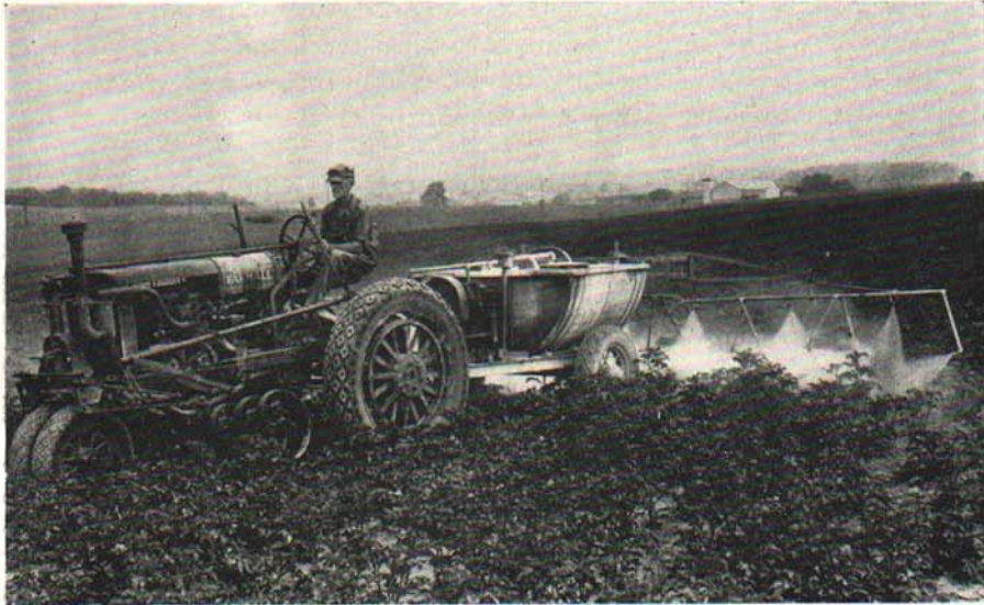
Fig. 4. Spray thoroughly with bordeaux mixture for the control of leafhoppers and blight.