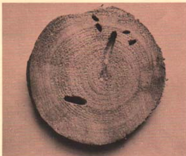
Feeding damage of buprestid (metallic wood-borer) larvae. The tunnels may be as much as 1/4 inch or more in diameter. The larval feeding damage of long-horned beetles is similar to the buprestids, but generally larger in diameter and less oval.

Inasmuch as long horned and metallic wood borer adults need bark on which to lay eggs, direct infestation of wood in houses is very doubtful. Of course a few exceptions to this exist. For example, the old house borer infests barkless wood, laying eggs in cracks and natural checks of boards. Occasionally it is a structural pest of buildings in the east. In Michigan it is seen very rarely. If tunneling (wood-boring) similar to the characteristics described here occurs in buildings 5 to 10 years old, do not disregard it. The damage could be more important than the usual long-horned or metallic wood-borer beetle damage to new buildings, although the old house borer can infest new houses.