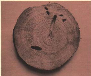
Feeding damage of buprestid (metallic wood-borer) larvae. The tunnels may be as much as \frac{1}{4} inch or more in diameter. The larval feeding damage of long-horned beetles is similar to the buprestids, but generally larger in diameter and less oval.

Inasmuch as long horned and metallic wood borer adults need bark on which to lay eggs, direct infestation of wood in houses is very doubtful. Of course a few exceptions to this exist. For example, the old house borer infests barkless wood, laying eggs in cracks and natural checks of boards. Occasionally it is a structural pest of buildings in the east. In Michigan it is seen very rarely. If tunneling (wood-boring) similar to the characteristics described here occurs in buildings 5 to 10 years old, do not disregard it. The damage could be more important than the usual long-horned or metallic wood-borer beetle damage to new buildings, although the old house borer can infest new houses.