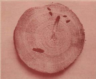
Feeding damage of buprestid (metallic wood-borer) larvae. The tunnels may be as much as 1/4 inch or more in diameter. The larval feeding damage of long-horned beetles is similar to the buprestids, but generally larger in diameter and less oval.

Inasmuch as long horned and metallic wood borer adults need bark on which to lay eggs, direct infestation of wood in houses is very doubtful. Of course a few exceptions to this exist. For example, the old house borer infests barkless wood, laying eggs in cracks and natural checks of boards. Occasionally it is a structural pest of buildings in the east. In Michigan it is seen very rarely. If tunneling (wood-boring) similar to the characteristics described here occurs in buildings 5 to 10 years old, do not disregard it. The damage could be more important than the usual long-horned or metallic wood-borer beetle damage to new buildings, although the old house borer can infest new houses.