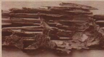
Termite damage. Note the "shelving" of the wood. Especially on the lower part of the picture, observe the corky material. This is yellowish and often black-speckled. Carpenter ants "shelve" wood by feeding similar to termites, but a sawdust is present with carpenter ants, absent with termites. The sawdust of carpenter ants is coarse and often held together by a webbing secreted by the insects.

The workers range in size from about one-fourth to one-half inch long. These are the big, black ants