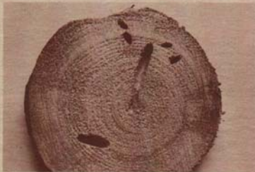
Feeding damage of buprestid (metallic wood-borer) larvae. The tunnels may be as much as 1/4 inch or more in diameter. The larval feeding damage of long-horned beetles is similar to the buprestids, but generally larger in diameter and less oval.

Many species of the long horned and metallic wood borers lay eggs in crevices of bark AFTER TREES ARE FELLED BUT BEFORE THEY ARE SAWED INTO LUMBER. The life cycle may be as long as 3 or more years for some species. Because of this, ample time exists for lumber to be used in houses before the grubs pupate and adult beetles emerge.