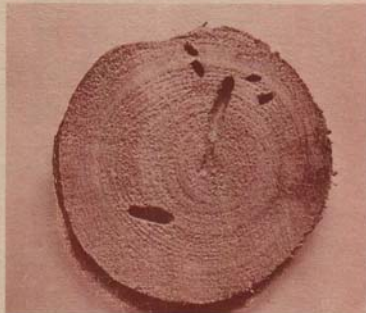
Feeding damage of buprestid (metallic wood-borer) larvae. The tunnels may be as much as \frac{1}{4} inch or more in diameter. The larval feeding damage of long-horned beetles is similar to the buprestids, but generally larger in diameter and less oval.

NOTE: While termite damage to the wood of homes and buildings can be serious, the progress of the trouble is not so rapid that you cannot take time to learn about the needs of satisfactory control. Get the above named bulletin and study it carefully before attempting termite control. In addition, get the trouble-causing insects identified by an expert. Damaged wood is also very helpful in telling the kind of problem you have. TERMITE CONTROL CAN BE EXPENSIVE, SO BE SURE ABOUT THE KIND OF PROBLEM YOU HAVE WITH THIS INSECT.