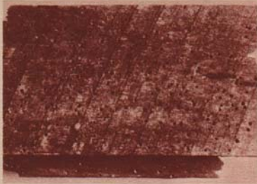
When adult Powder Post beetles emerge, some species leave small holes about the size of a pin in the surface of the wood; others make holes the size of pencil lead. Note the tunneling is to both wood and bark, but primary concern is the damage to the wood.

The Lyctus powder post beetles are usually brought into buildings in lumber which has been stored in yards or at building sites. They may also be present