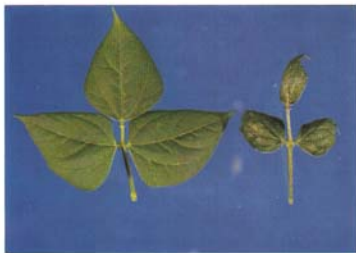
Figure 8. Manganese toxicity in field beans. Scorching of the leaf margins and leaf cupping.