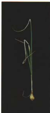
Figure 17. Copper-deficient onion. Tip dieback of the tops. Poor pigmentation of the bulb.