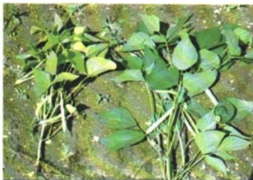
Figure 2. Sulfur-deficient dark red kidney beans. Light-green color and reduced growth, left. Resembles nitrogen deficiency. Plants mature early. Normal plant, right.