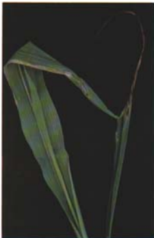
Figure 18. Copper deficiency in sudangrass. Wilting and eventual death of the leaf tips. Symptoms may resemble frost damage.