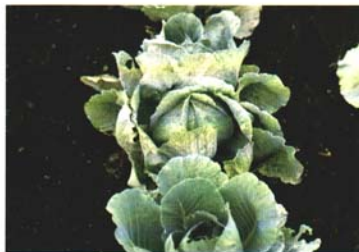
Figure 5. Manganese deficiency in cabbage. Interveinal chlorosis of the leaves generally over the entire plant, center. Healthy plant in front.