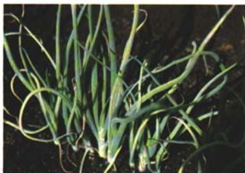
Figure 15. Zinc-deficient onions. Yellow striping, twisting and bending of the tops.