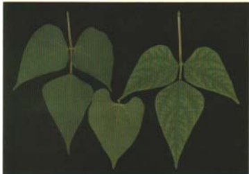
Figure 7. Manganese deficiency in field beans. Yellow mottling between the veins, right. Symptoms occur 3 to 4 weeks after emergence. Normal leaf, left.