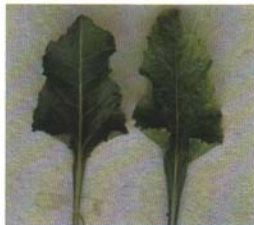
Figure 6. Manganese deficiency in sugar beets. Mottling between the veins, right. Chlorosis usually begins on the younger leaves. Severe deficiency causes gray and black specks along the veins.