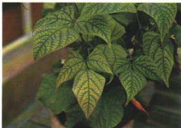
Figure 3. Manganese-deficient dark red kidney beans. Yellowing between the leaf veins. Veins remain green.