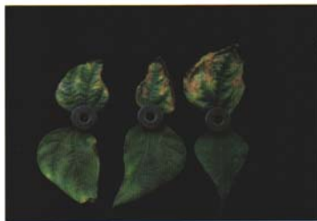
Figure 13. Zinc deficiency in field beans. Pale-green leaves, yellow near the tips and outer edges at or soon after emergence. Leaves later become dwarfed or deformed and die. Plants are slow to mature. Normal leaf, upper left.