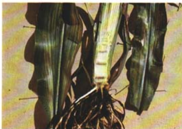
Figure 14. Zinc-deficient corn. White- to yellow-striping of the leaves near the stalk. Shortened internodes with reddish discoloration of the nodal tissues.