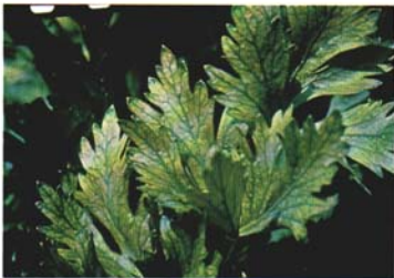
Figure 4. Manganese-deficient celery. Chlorosis of the leaves between the dark veins.