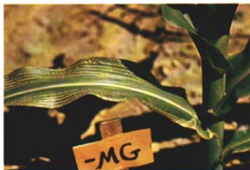
Figure 1. Magnesium-deficient corn. Older leaves show interveinal chlorosis. Symptoms usually appear early but may later disappear. Severe deficiency causes stunting.

mixture as soon as possible to prevent caking. Place the fertilizer in bands about two inches away from the seed to prevent fertilizer injury to the crop.