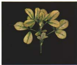
Figure 9. Boron-deficient alfalfa. Yellow to reddish-yellow discoloration of the upper leaves, short nodes and few flowers. Often confused with leafhopper damage.