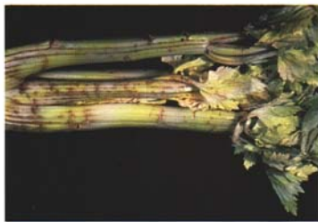
Figure 10. Boron-deficient celery. Also known as "crack stem" because brown cracks develop along the stem rib and later across the stem.