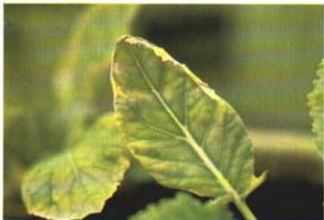
Figure 16. Molybdenum deficiency in cauliflower. Yellow mottling between the leaf veins, rolling or curling upward and crinkling of the leaves. Symptoms resemble nitrogen deficiency.