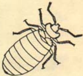
BED BUG 1/8 to 1/4 inch long

Bed bugs move readily from room to room, or from building to building, especially in summer. They leave a tell-tale odor which to some people strongly resembles fresh red raspberries, providing these have been fed upon by stink bugs. The odor is especially noticeable when large numbers of bed bugs infest a building. They can live 2 months or longer without a blood meal.