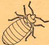
BED BUG 1/5 to 1/4 inch long

Bed bugs move readily from room to room, or from building to building, especially in summer. They leave a tell-tale odor which to some people strongly resembles fresh red raspberries, providing these have been fed upon by stink bugs. The odor is especially noticeable when large numbers of bed bugs infest a building. They can live 2 months or longer without a feeding of blood.