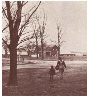
"A lot of farmers I know would enjoy spending some leisure time with their families . . ."

Sometimes Paul has something special to show us: baby cotton-tails under a brush pile, or a buck deer that grazes with the cattle. These things delight the children, who leap from the back of the pickup at every stop to go bounding around and to explore.