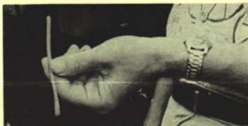
Fig. 3 Cut the leaf blade from the petiole. Discard the leaf blade and save only the petiole.