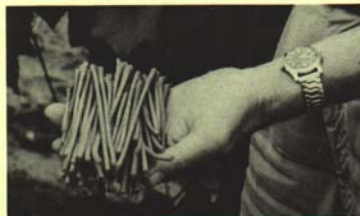
Fig. 4 Collect 100 grape petioles for analysis. Dry them in a paper bag for several days at room temperature.

pleted and returned to the grower within 60 days after being received at the Department of Horticulture.