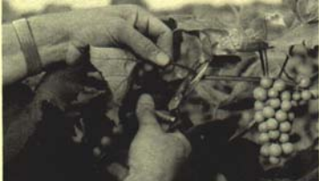
Fig. 2 Select mature grape leaves near the center of the shoot. Cut off the leaf including its petiole or stem close to the shoot.

When will results be available? Tree fruit and grape samples to be analyzed for potassium only will be com-