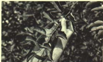
Fig. 1. For tree fruits, select all leaves from the middle of current terminal shoots. Remove the leaves with a downward pull so the stem remains with the leaf.