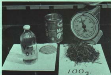
STEP #1 — Weigh out 100 grams of forage and set aside. Note simple equipment needed.