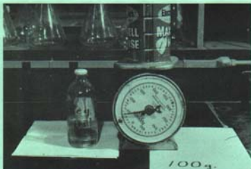
STEP #4 — After heating, set container and contents (oil, forage, screen) on scale. If dial was set at "0" in step 2, you are reading the dry matter "contained in 100 grams of forage or percent of dry matter".

F. Continue heating for about 15 minutes or until the oil temperature reaches 145°C for forage samples, (190°C for grain). Tip the pan back and forth to make sure all the sample is well heated and to get an accurate value of oil temperature.