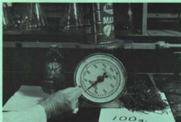
STEP #2 — Weigh container, with vegetable oil inside and screen. Set movable dial to "0".