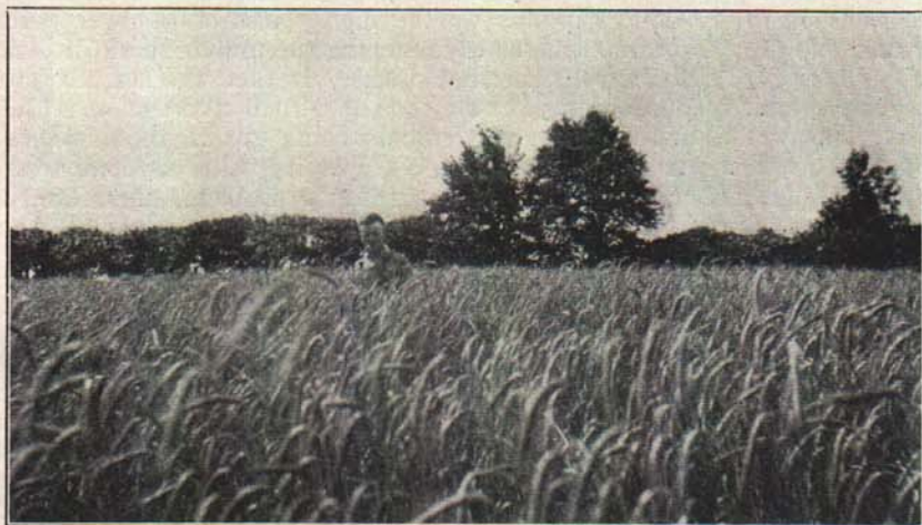
For years Rosen Rye has Demonstrated its Superiority for Michigan Conditions.

That Rosen Rye is the most profitable variety for a Michigan farmer to grow is no longer a matter of question. So convincingly has this variety demonstrated its superiority, in this state, that practically all of the rye grown in Michigan is Rosen of greater or lesser purity.