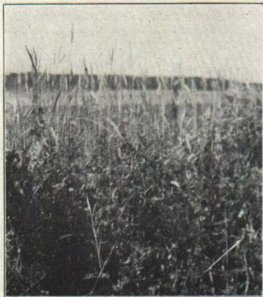
Rye and Vetch Make a Good Combination for a Cover Crop or for Seed.

Farmers growing rye on the lighter soils have found that the seeding with it of eighteen or twenty pounds of Hairy or Winter Vetch seed per acre added much to the profit of the crop. The yield of rye can be maintained in the combination and it handles the production costs well, while the two to five bushels of vetch per acre, readily separated from the rye, contributes its income as almost clear profit. Michigan grown winter vetch seed is in strong demand and much of the country looks to this state for a satisfactory supply.