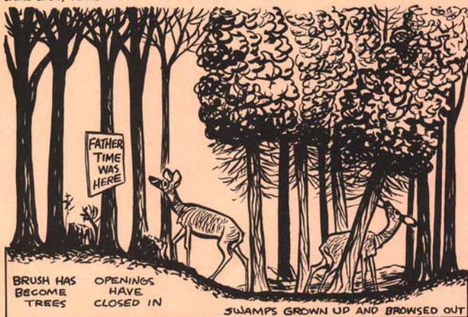
SAME SPOT, YEARS LATER — NOW POOR DEER RANGE