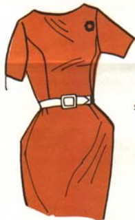
LACK OF EASE STRAINS GARMENT

TO PROVIDE EASE, DARTS MUST POINT TO THE FULLEST PART OF A CURVE