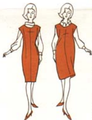
BALANCED GRAINLINE UNBALANCED GRAINLINE