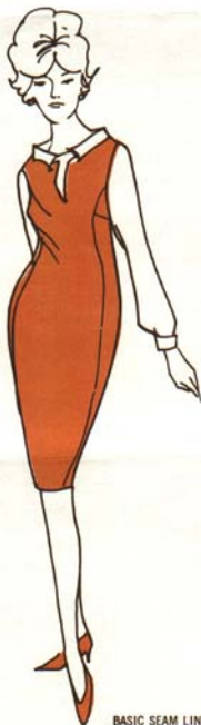
BASIC SEAM LINES FOLLOW BODY LINES