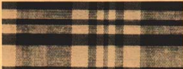
This is a 100 percent Dacron fabric. Soil does not penetrate.

Polyesters (Dacron, Fortrel, Kodol, and Vycron) with their ability to resist wrinkles will contribute to wrinkle resistance of fabrics. Acrylics (Orlon, Zefran, Acrilan, Creslan) will contribute to shrink and stretch resistance or shape retention.