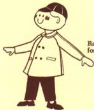
Raglan sleeves allow room for growth