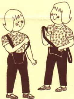
Garments with straps should be easy to manage