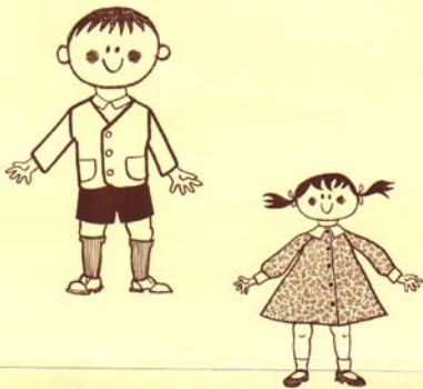
Front openings make dressing easier for tots

Well constructed clothing is required for the strains in wearing and laundering to which a child's clothing is subjected.