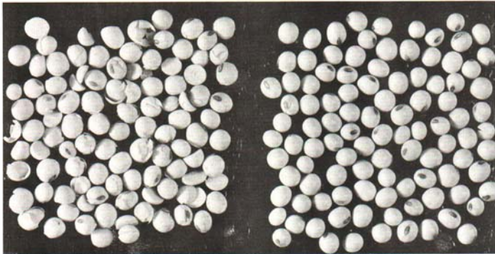
Fig. 3 — Effect of harvesting on the quality of soybeans. Left—poor quality (harvest damage). Right—good quality.

At times during the day the beans may be so dry, or the humidity so low, as to cause excessive cracking or damage. The usual solution is to stop combining during the hottest and driest part of the day.