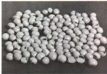
Fig. 1 — Seed quality: Left, sound seed; Right, seed with cracked seed coats.

7. High laboratory germination (85% and above).