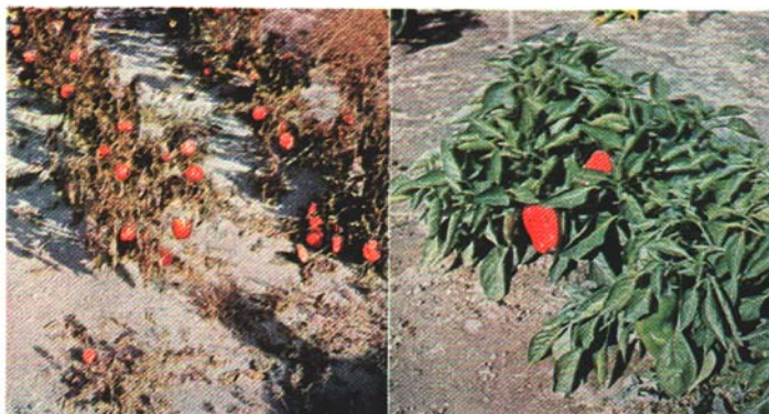
Fig. 3. Results of frost control with sprinkler irrigation. Frost-killed peppers on the left were given no protection. Peppers on the right were protected by continuous water application—and survived a recorded low temperature of 21°F.

Most of the rotary irrigation sprinklers used in Michigan, espe-