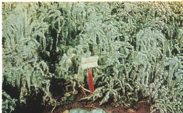
Fig. 1. Continuous sprinkler irrigation formed ice to the thickness of \frac{1}{2} inch on these pepper plants in an experimental plot during a late-fall frost. Yet after the ice was melted, the plants were found to be healthy, vigorous, and undamaged by the freezing temperatures.

Still, clear nights with low temperatures forecast usually indicate possible "radiation" frosts. The weather condition is this: a cold mass of air moves into the area behind a "cold front". Then, if the wind dies down toward evening or during the night and the sky becomes clear, heat is radiated from the plant and the soil to the colder outer atmosphere. The temperature near the ground surface may drop very quickly, as much as 4 degrees in an hour.