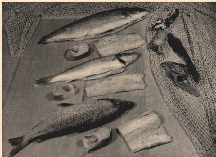
Choice among the larger fish (top to bottom): the Lake Trout, the Walleye, the Whitefish—each shown in the steak and fillet form as well.

Place the first seven ingredients in a sauce pan and bring to the