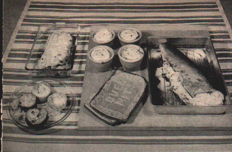
Baked Lake Trout with dressing.