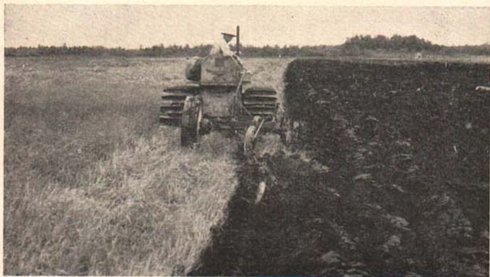
Fig. 4. Deep breaking with marsh breaker, to a depth of 14 to 16 inches, to bury completely the native growth, followed by thorough disking to smother the marsh grasses, results in a seedbed free from wild sods and weed seed which can be fertilized, compacted by heavy rolling and seeded with a minimum of effort.

Following the breaking, the double-disk harrow should be used to maintain a clean fallow until time for seeding. On many virgin marshes, the use of a leveler (see Special Bulletin 314) to fill depressions and put the land in good condition for mowing, is advisable. Just before seeding and following fertilization, the muck should be made firm by weighted farm roller or cultipacker.