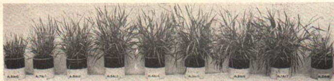
Fig. 1. Of the nine jars of reed canary grass shown above, the one at the left contained alkaline muck (pH 7.6) while the one at the right contained very acid muck (pH 3.6). The jars between contained, from left to right, decreasing amounts of the alkaline and increasing amounts of the very acid muck, mixed together. Five mixtures (4th to 8th jars from the left), with pH reading from 6.4 to 4.4, gave somewhat similar yields, indicating a fairly wide range of tolerance of acidity on the part of the reed canary.

Disadvantages —1. It is sometimes necessary to confine livestock to the reed canary pasture in order to force them to eat it. The quality can be improved by proper fertilization, but the quality of fertilized brome grass is superior to that of fertilized reed canary where the drainage is sufficient for brome.