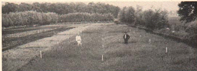
Fig. 2. The brome grass on the left of the stake and reed canary grass on the right were fertilized each year with 0-0-30 (straight muriate of potash) in the foreground and with 0-5-30 just beyond the first stakes. When first reclaimed the potash alone gave almost as much hay as did the 0-5-30 but, after five years of cropping, the natural phosphate in the muck in the foreground was exhausted and potash alone did not yield any better than the plot which had never received fertilizer while the yield with the 0-5-30 was practically six times as much.