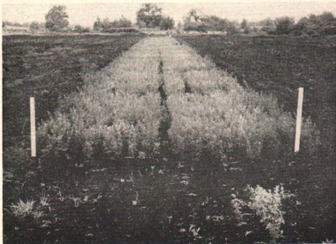
Fig. 5. On this very acid muck (original pH 4.0) which was given an 8-ton application of ground limestone, a very uniform stand of alfalfa was obtained on all plots with a uniform application of 3-9-18 from a seeding made in the spring of 1949. Without an application of copper sulfate, however, the alfalfa on this side of the white stakes was almost entirely heaved out during the winter of 1949-50, while with copper sulfate (alfalfa beyond the stakes) the vigorous root development prevented heaving and a good stand remained in 1950.

On decidedly alkaline muck soil, the grasses and alfalfa are likely to respond to manganese sulfate in the fertilizer, unless sulfur has been applied as previously described. On highly alkaline muck it is sometimes necessary to apply both. Because of increased root development, resulting from manganese in the fertilizer on alkaline soil, its use is likely to insure the wintering over of the legumes.