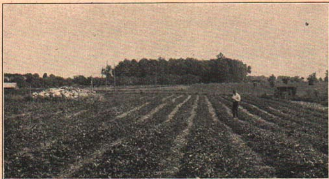
Fig. 1. A field of Dunlap strawberries near Fremont, Mich. Note the gently sloping site which insures good air and water drainage.

in one hundred is usually sufficient for this purpose. Steep slopes should be avoided as they are likely to wash badly and cultivation is more difficult. A site somewhat elevated above the surrounding country, is desirable. Plants on a site with even a slight elevation will often escape injury from frost because of the better air drainage thus provided. Since cold air drains into the lower places, low flat lands are usually more frosty than the higher lands. Despite this fact, however, many strawberries are grown on bottom lands. These lands are usually rich and moist and, where the damage from frost is not severe, may be desirable, especially for growing the everbearing and late spring-bearing varieties. Where early ripening is desired a southern slope should be selected, if available. A site with a southern exposure is warmer and drier, and the season of ripening is often several days earlier than on northern exposures or on bottom lands. For late varieties, northern exposures or well drained bottom lands are preferable since they are cooler, more moist, and, hence, more productive. In sections bordering on Lake Michigan, an exposure toward the moist moderating winds from the lake is always desirable.