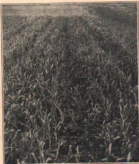
Fig. 2. Fall oats grown as a mulch crop between the strawberry rows. This should be supplemented with a light covering of straw over the rows.

The mulch should be opened over the plants as soon as growth commences in the spring to allow them to grow through and prevent smothering. If the mulch is loose and not more than an inch or so in thickness it may not need to be disturbed, but if it is several inches in thickness it should be parted or opened over the plants, and any surplus material removed and pushed into the alleys between the rows. This mulch should be left on the patch until the end of the harvesting season. When removing the mulch from over the plants, one should leave as much as possible around the base of the plants to keep the berries clean and conserve moisture. Opening of the mulch should be delayed as long as possible in the spring to help retard blossoming, and thus prevent possible damage