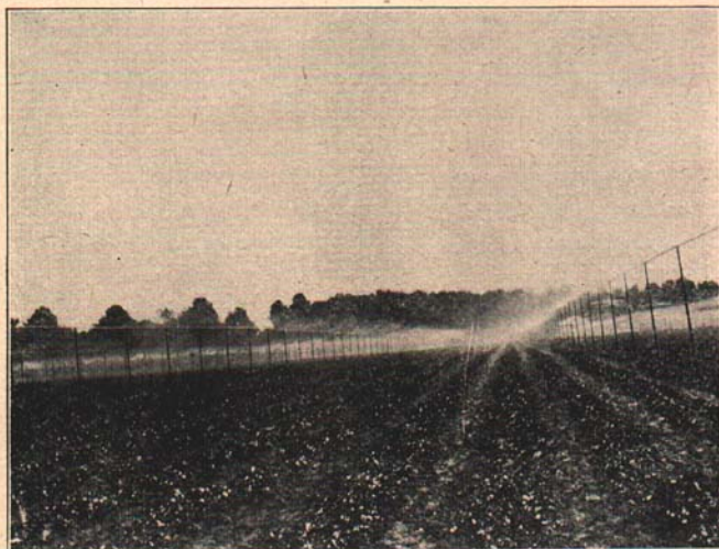
Fig. 3. Overhead irrigation is an insurance against drouth and also may be used for warding off light frosts during the blossoming season.

The overhead or sprinkler system is most commonly used. This system has the advantage that it can be used on either level or slo-