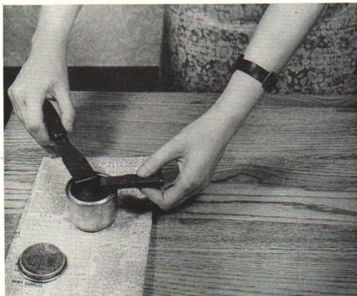
Fig. 4. Holes and large cracks are filled with stick shellac of matching color.

The following equipment should be near the hole that is to be filled: A flame (canned heat, alcohol lamp, gas jet) or an electric sol-