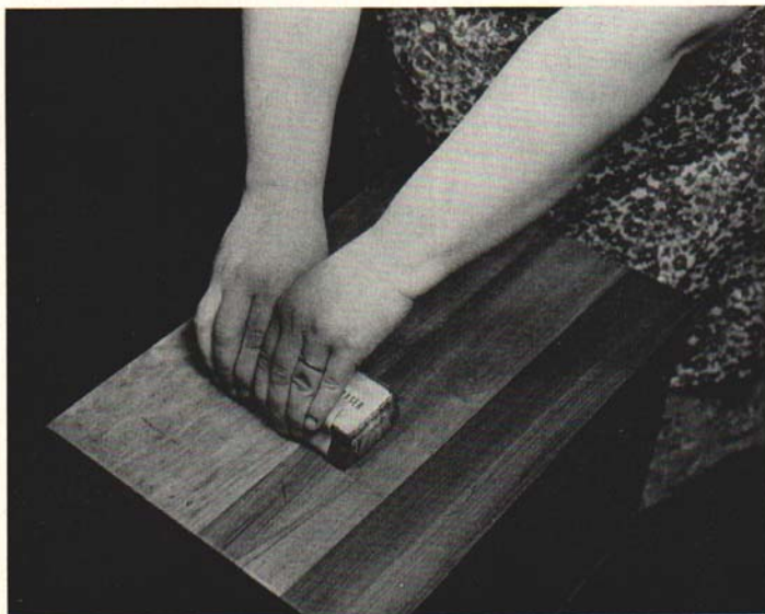
Fig. 6. A sanding block, for sanding large surfaces, can be made by wrapping the sandpaper around an eraser.

The success of a beautiful finish depends upon the completeness of the sanding which is done before the new finish is applied. Wrap \frac{1}{4} sheet of sandpaper around a blackboard eraser or a padded block of wood. Sand straight with the grain of the wood. Sand the wood well with each grade of sandpaper. After the final sanding the wood should be as smooth as glass (Fig. 6).