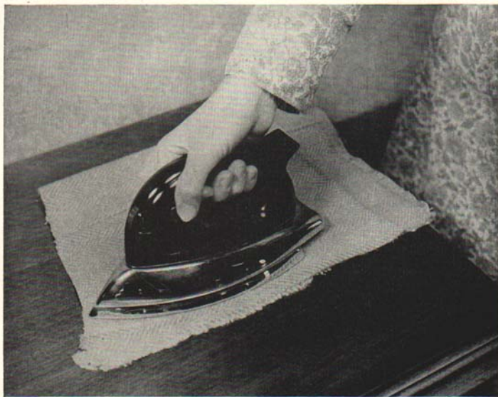
Fig. 5. Remove dents with a damp woolen cloth and a warm iron.

dering iron; a putty knife, an old steel knife or screw driver; shellac stick that will match the wood after the finish is applied (Fig. 4).