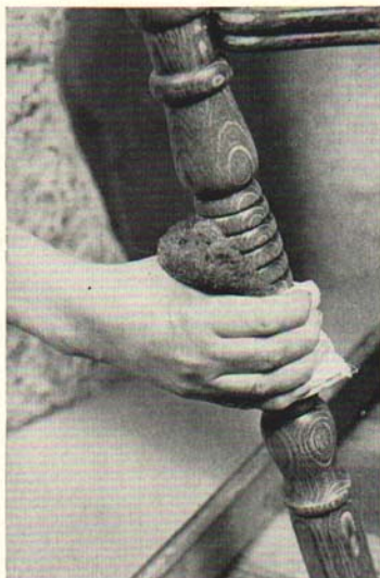
Fig. 2. Use steel wool and alcohol to remove the finish from turnings.