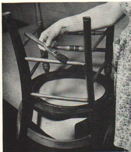
Fig. 7. Turn the piece of furniture upside down and apply the finish to the underneath parts first.