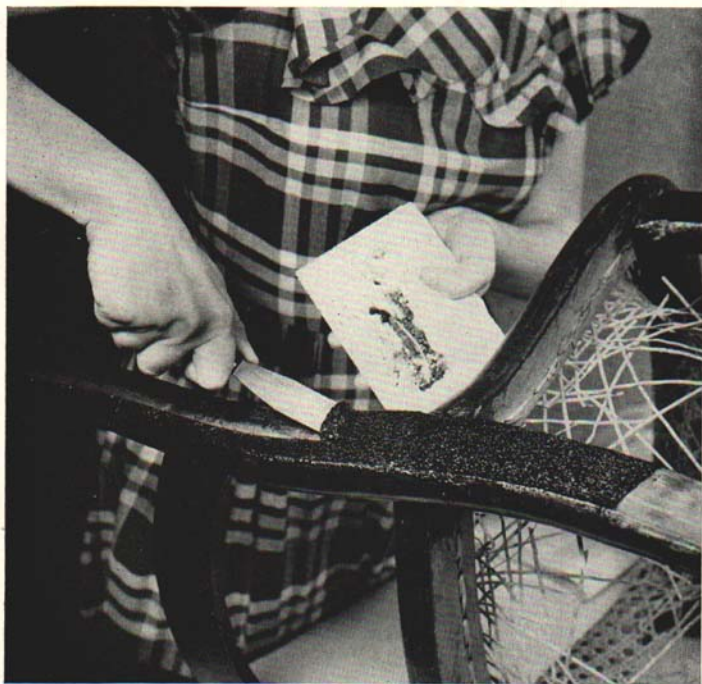
Fig. 1. Remove the old finish, which has been softened by a liquid remover, with a putty knife held firmly against the wood. Take care not to scratch the wood. The old finish can be wiped onto a newspaper which can then be burned immediately.

A combination of these methods is frequently used in order to completely remove the old finish.