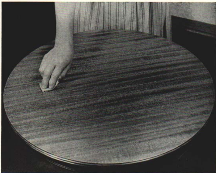
Fig. 8. Apply the penetrating seal liberally at first with a folded cloth. Rub the seal into the wood, going across the grain and finishing with the grain.

Four to twelve coats of the oil mixture are needed to build up a satin finish. The piece of furniture may be used during the finishing process as these additional coats may be spaced a week or more apart.