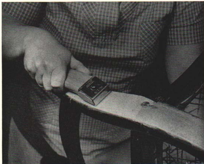
Fig. 3. A scraper is used to remove the old finish from flat surfaces.

Gluing — Examine the surfaces to be glued. Scrape off all the old