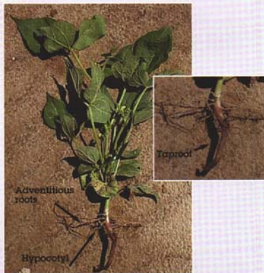
Figure 1. Severe Fusarium root rot kills primary and secondary roots of beans, and most times only adventitious roots are visible. Note the typical red-brown symptoms of Fusarium root rot on the taproot.

Unlike other root-rotting diseases, Fusarium root rot does not cause seed rot or damping-off of seedlings. Symptoms do not appear until two or three weeks after planting. The first symptoms are narrow, long, red to brown lesions on the stems; lengthwise cracks often develop (Fig. 1). Lesions extend down the main taproot, which may shrivel, decay and die. The symptoms in some cases extend up the hypocotyl to the soil surface. Clusters of fibrous roots (lateral roots or adventitious roots) commonly develop above the shriveled taproot (Fig. 1). These roots can compensate to some extent for dead roots, and under ideal growing conditions they will limit above-ground symptoms. Infected plants are frequently stunted, grow slowly compared with healthy plants, and are light green to yellow. Poor root function deprives plants of nutrients and water, which can result in uneven plant stands and reduce yield.